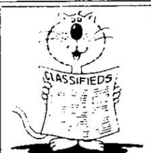
Be A Cool Cat And Check Out the Savings in the Classified Section

Attention Men and Women, Improve your health and fitness now. Call Work That Body - 877-0771.