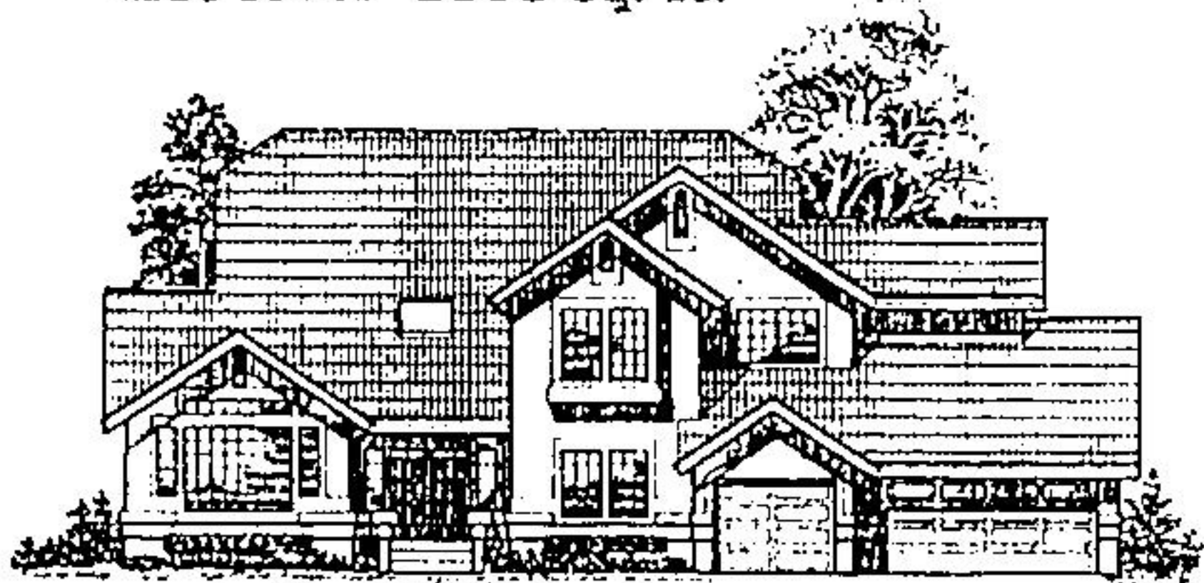
Plans include all exteriors shown