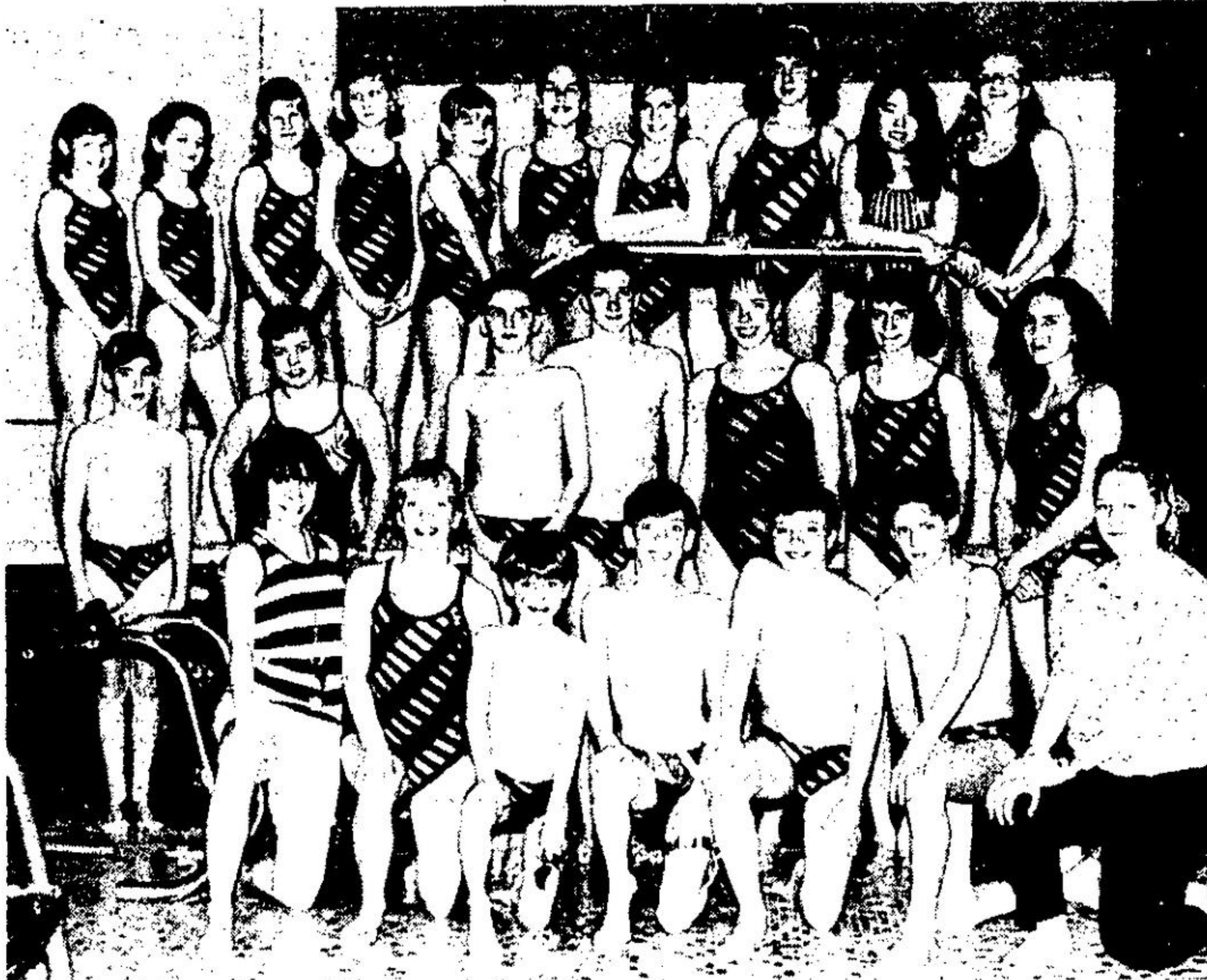
Halton Hills Blue Fins Swim Club (with many of its members pictured here) has worked on improving its finishes at various meets this year and is looking to give its athletes an extra edge by in-

"We also sell cheese during the year and hold a barbecue at the meet to help raise money for our expenses during the season. There is also a dance and a beach party, making things a little more fun for everyone."