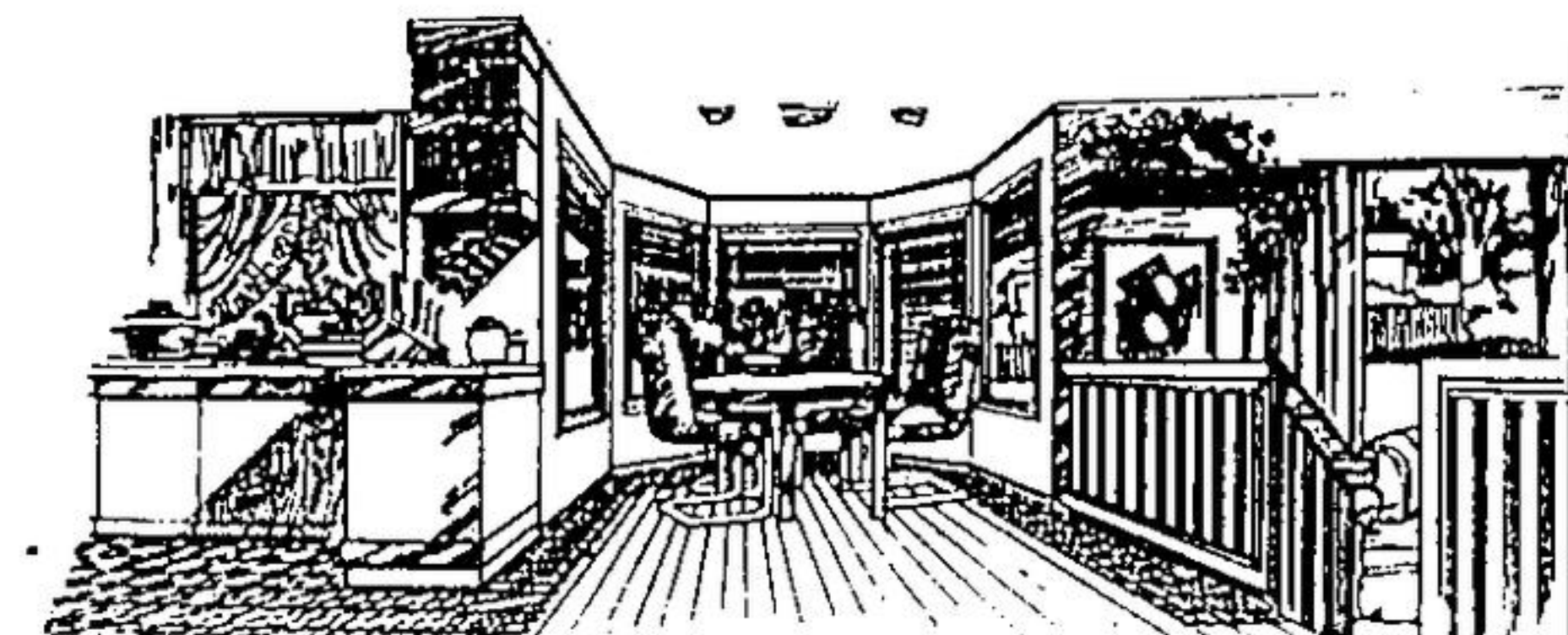
Breakfast area with bay window overlooking family room