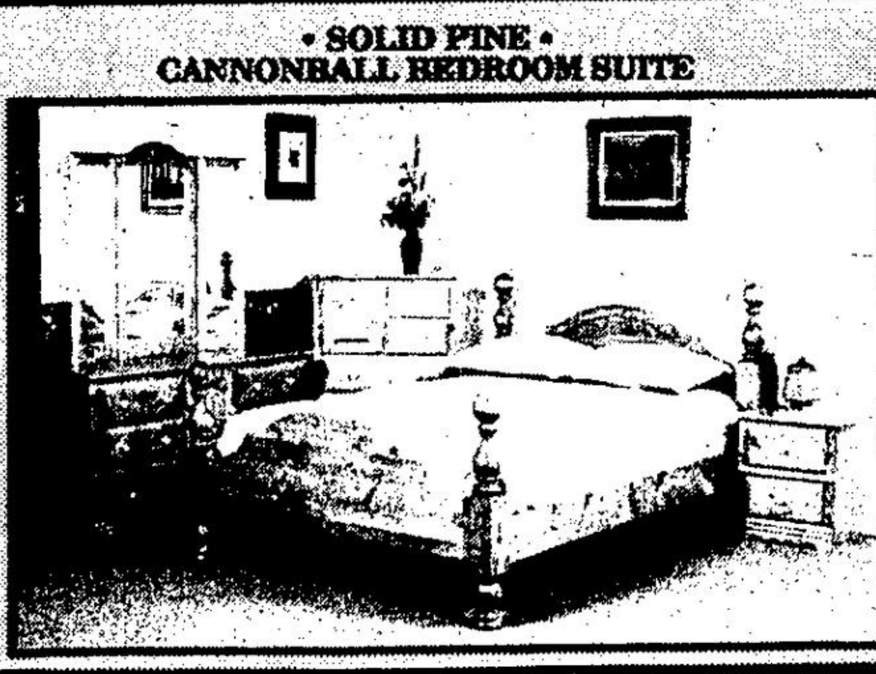
SOLID PINE CANNONBALL BEDROOM SUITE