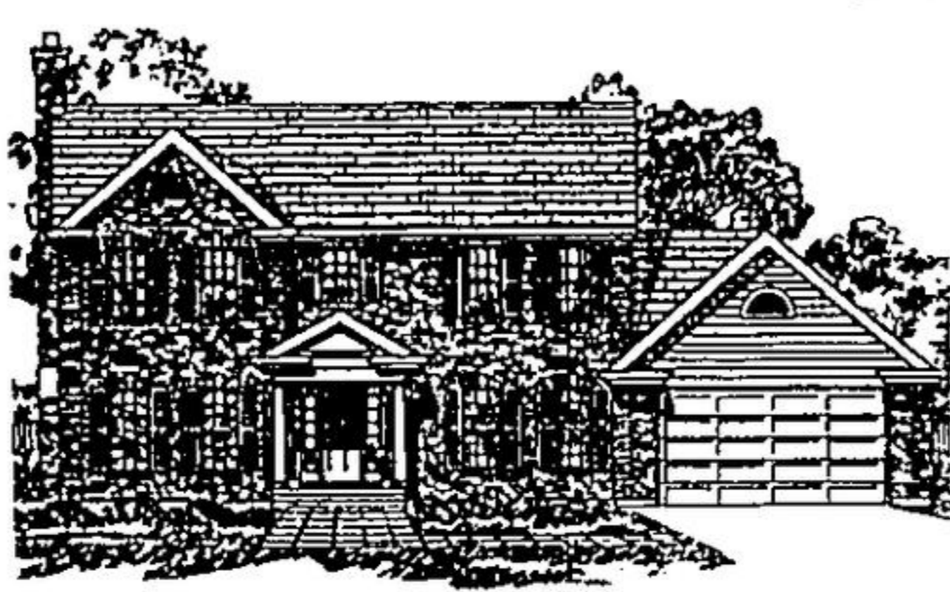
Plans include all exteriors shown