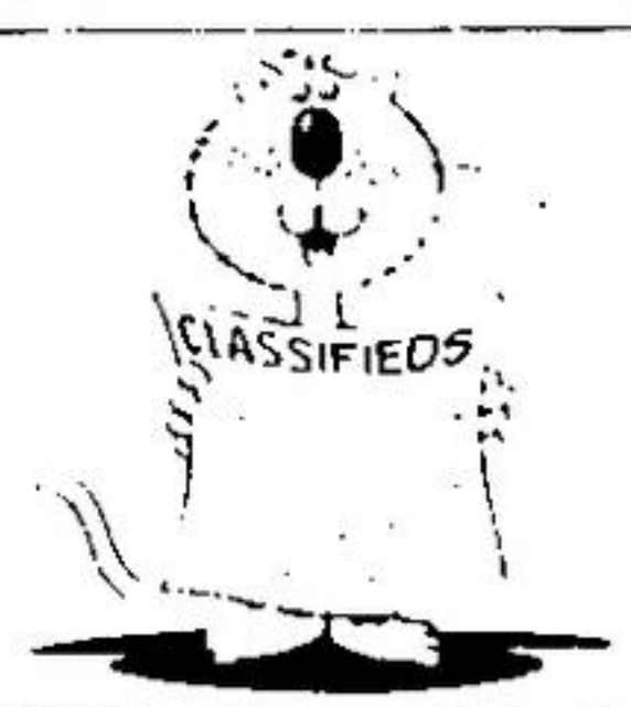
Be A Cool Cat And Check Out the Savings in the Classified Section

1989 Red Z28 Iroc convertible, black top, power steering, power brakes, power windows, power locks, 5 speed. AM/FM stereo. 27000 km. 877-3338 (es)