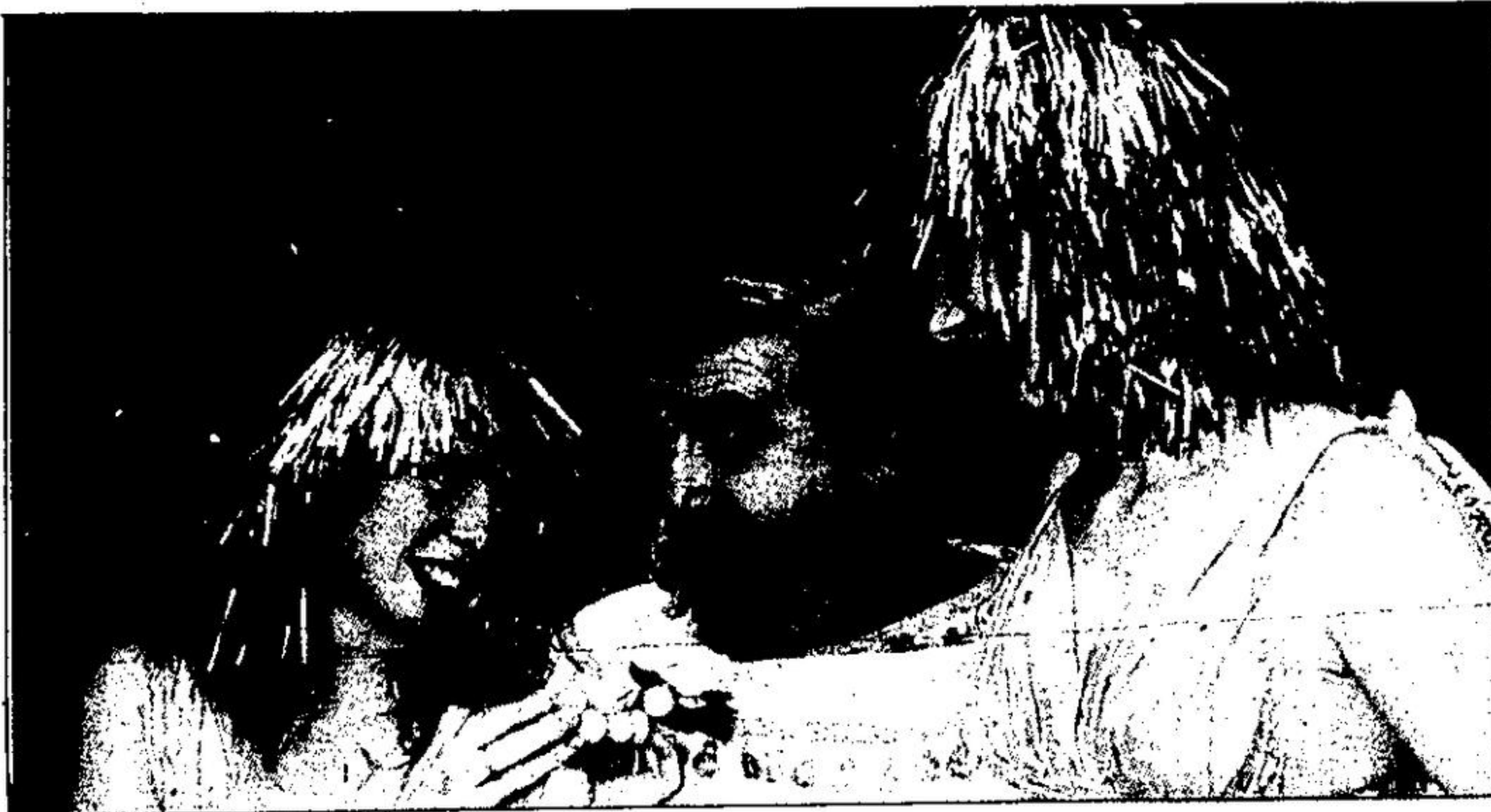
Globe Productions will be presenting "A Funny Thing Happened On The Way To The Forum" as its spring 1991 production with performances scheduled for May 2, 3, 4, 9, 10 and 11 at the John Elliott Theatre located in the Halton Hills Cultural Centre