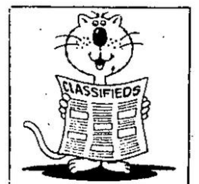
Be A Cool Cat And Check Out the Savings in Our Classified Section.

Wanted ride Acton to Brampton Hwy 10 and 7 area, 7:45 - 4:30 work hours. Commencing April 1. Call Hugh at 853-0303 after 5:30.