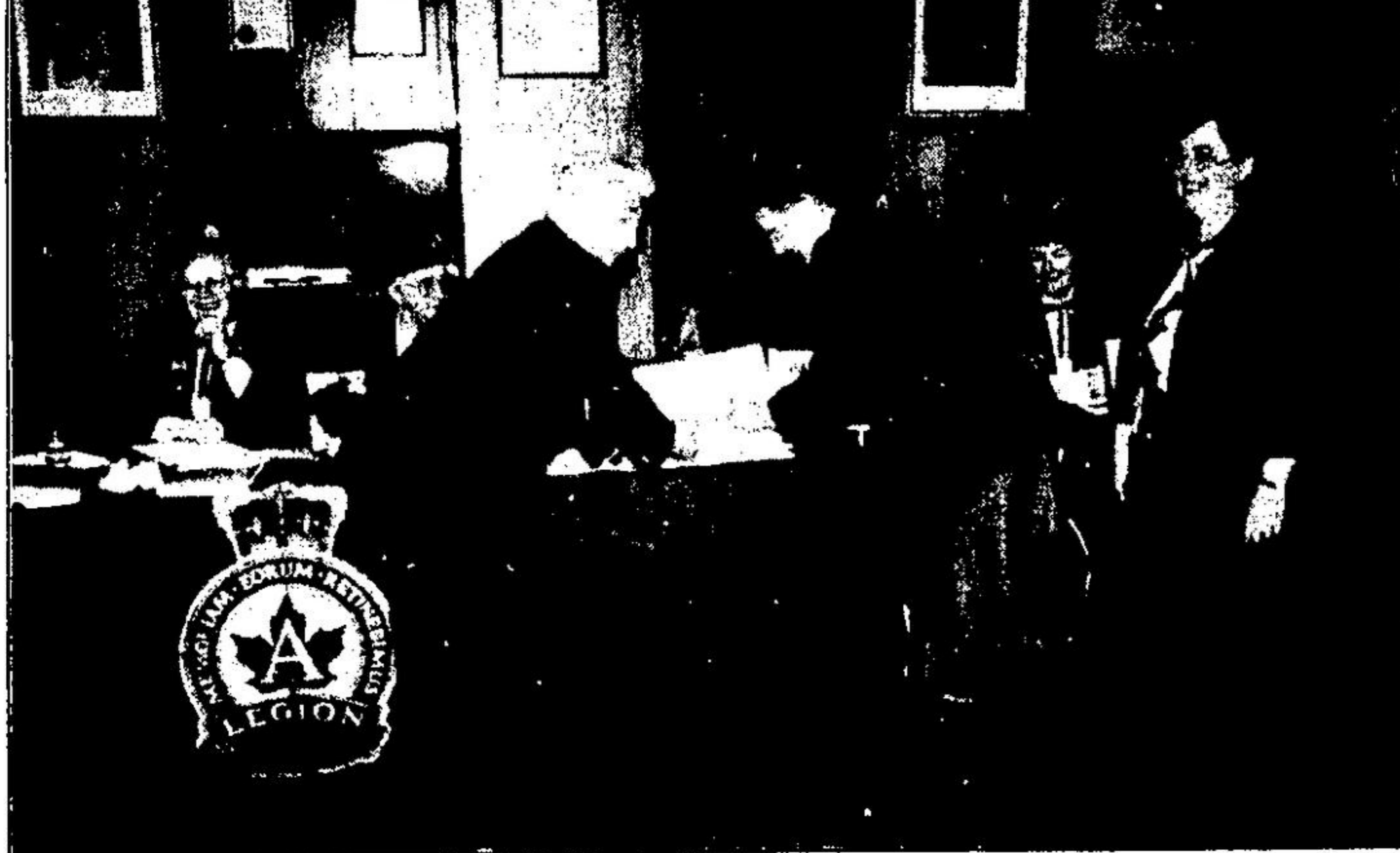
Georgetown Branch 120 Royal Canadian Legion and the Branch's Ladies Auxiliary, combined forces to present a cheque for $2,000 to Halton Hills libraries 'Talking Books for the Blind' fund. Pictured above, Georgetown Branch 120 Royal Cana-