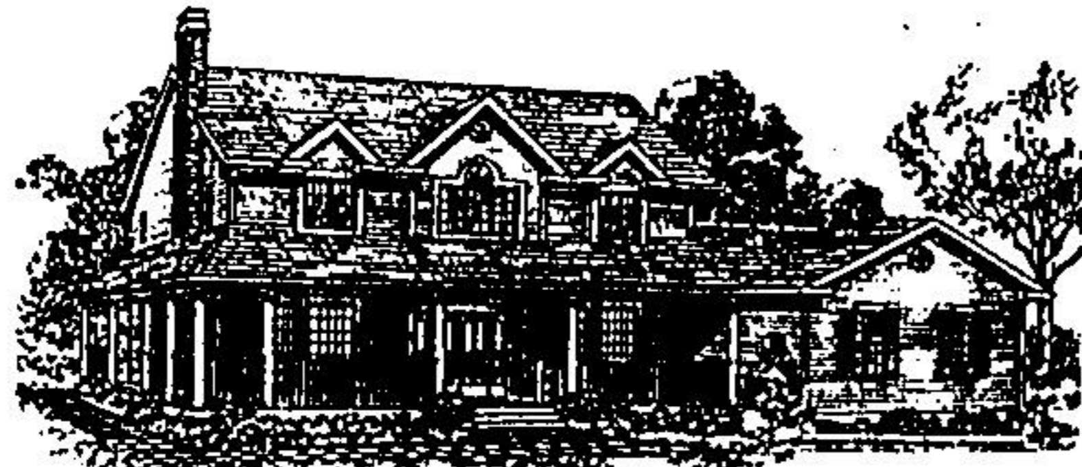
Plans include all exteriors shown

Changing demographics will combine with the federal government's fight against inflation to limit price increases for the foreseeable future. The post-war baby boom is fully housed; the succeeding generation is not as numerous. Unless a wave of new immigrants spurs demand, prices will level off. Price gains will return to the historical pattern of keeping pace with inflation.