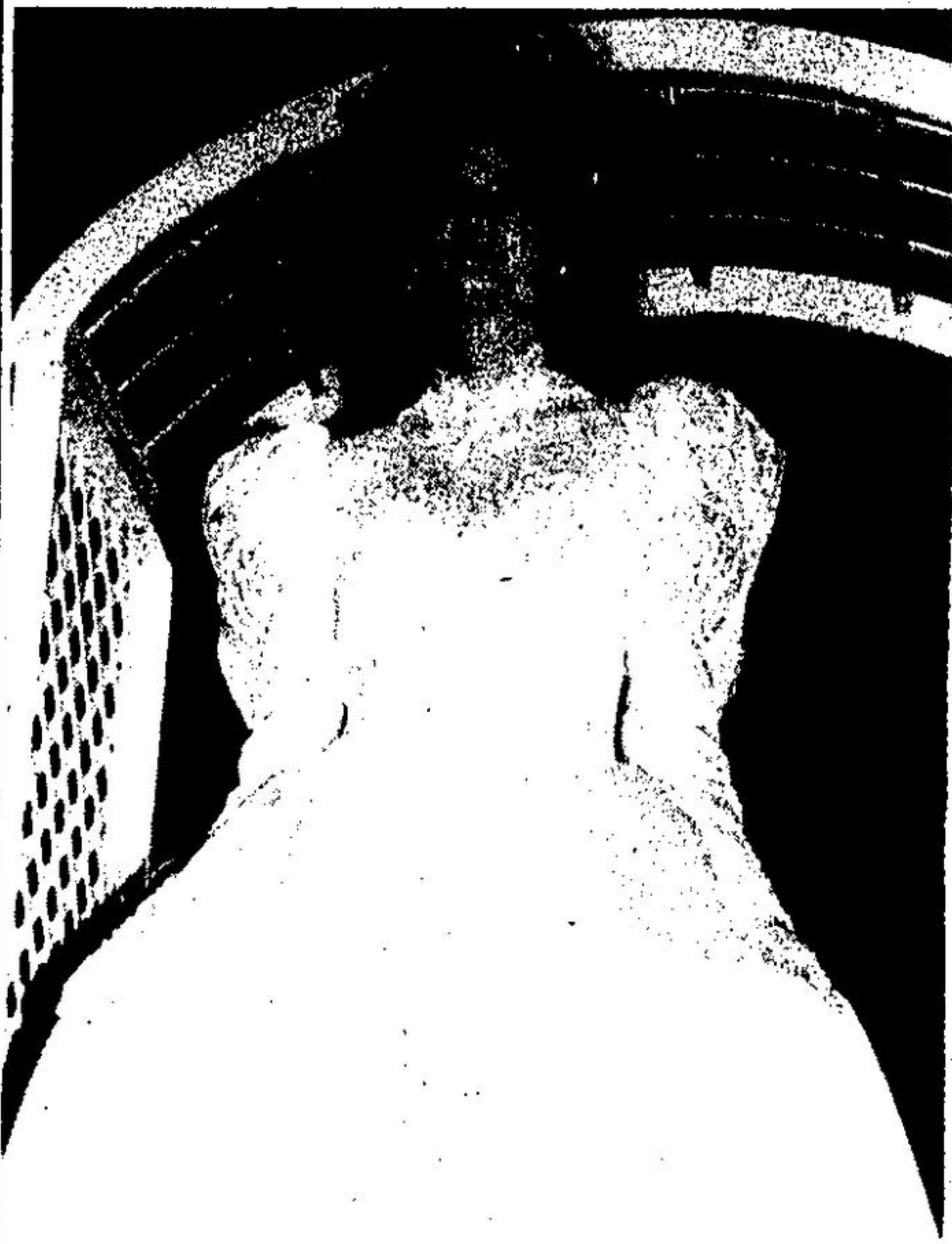
Ahhhh, the perfect bride. That's what probably ran through the minds of the brides to be attending Sunday's Welcome Wagon-sponsored Bridal Party at the John Elliott Theatre when they first laid eyes on this magnificent bridal gown provided by Oakville-based Charlie Bridal Salon.