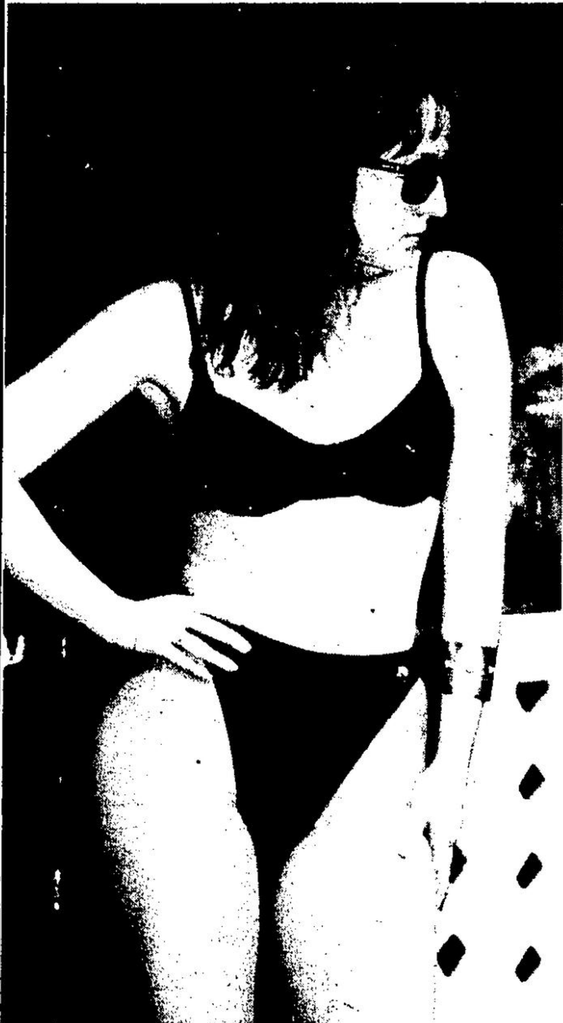
This is just one example of the swimsuits modelled at the Welcome Wagon-sponsored Bridal Party Sunday at the John Elliott Theatre that would be fitting for that perfect honeymoon on the beach. The cruisewear was provided by Georgetown's Anna Christine's For Hair.