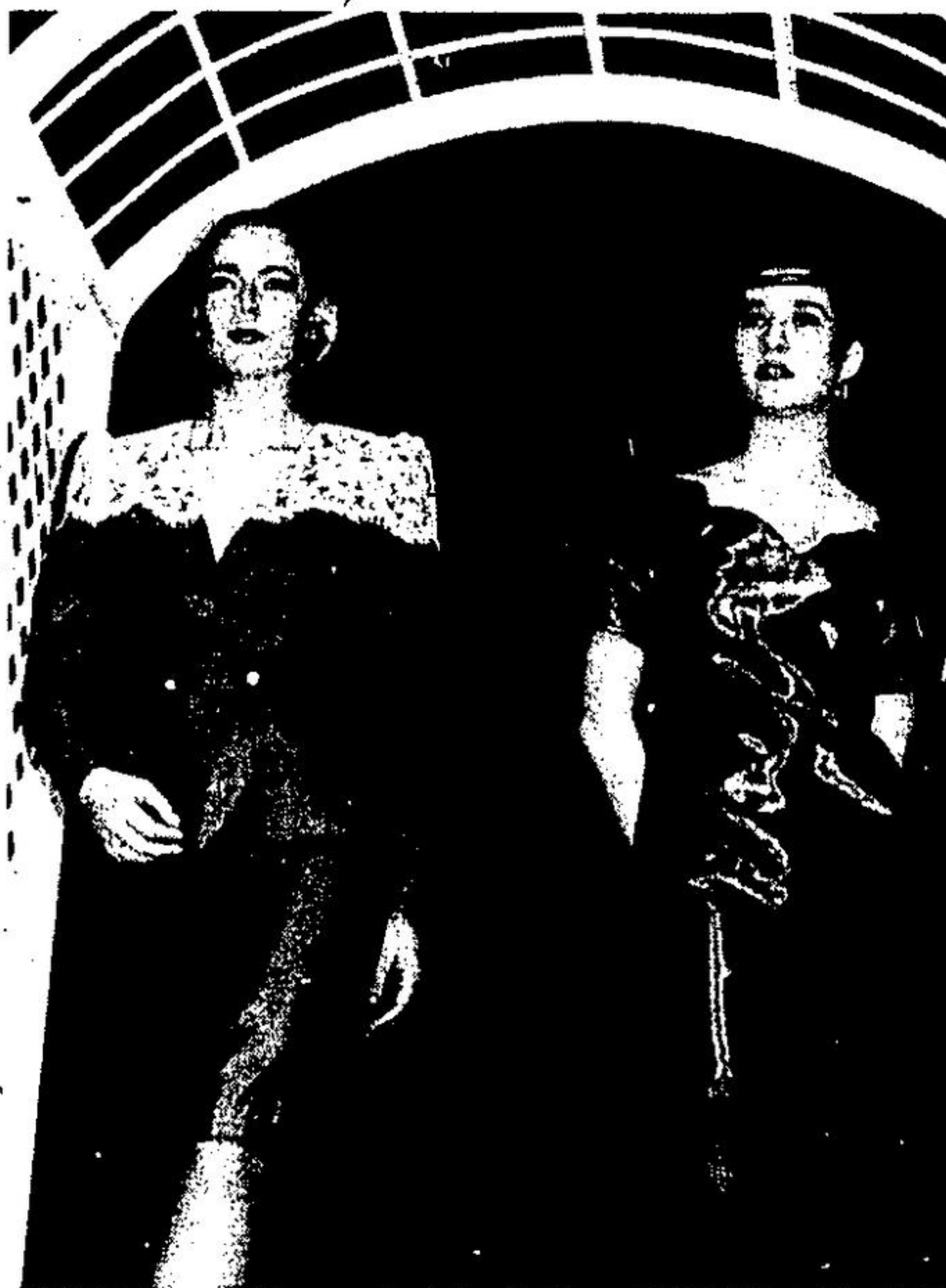
Sophistication best describes this elegant wedding attire that was modelled during the Welcome Wagon-sponsored Bridal Party Sunday at the John Elliott Theatre in Georgetown.