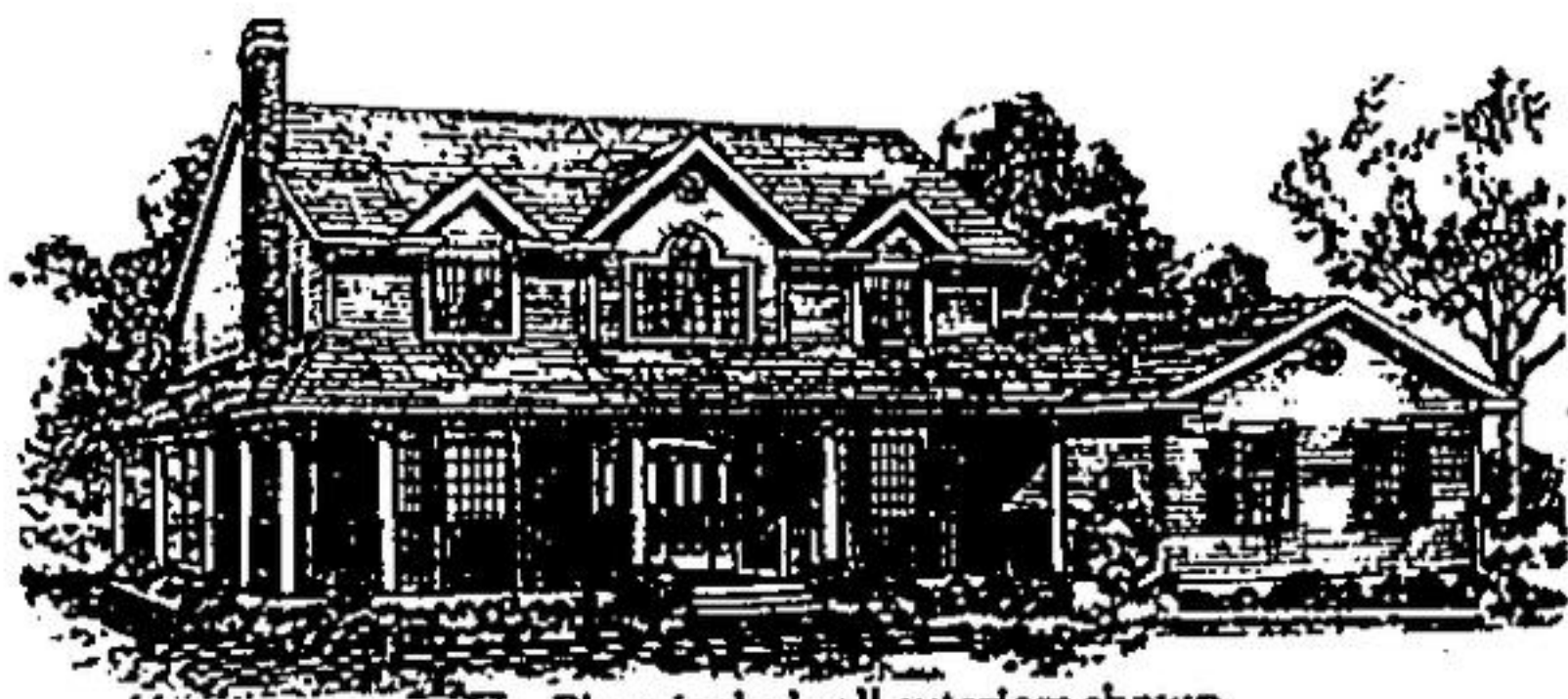
Plans include all exteriors shown