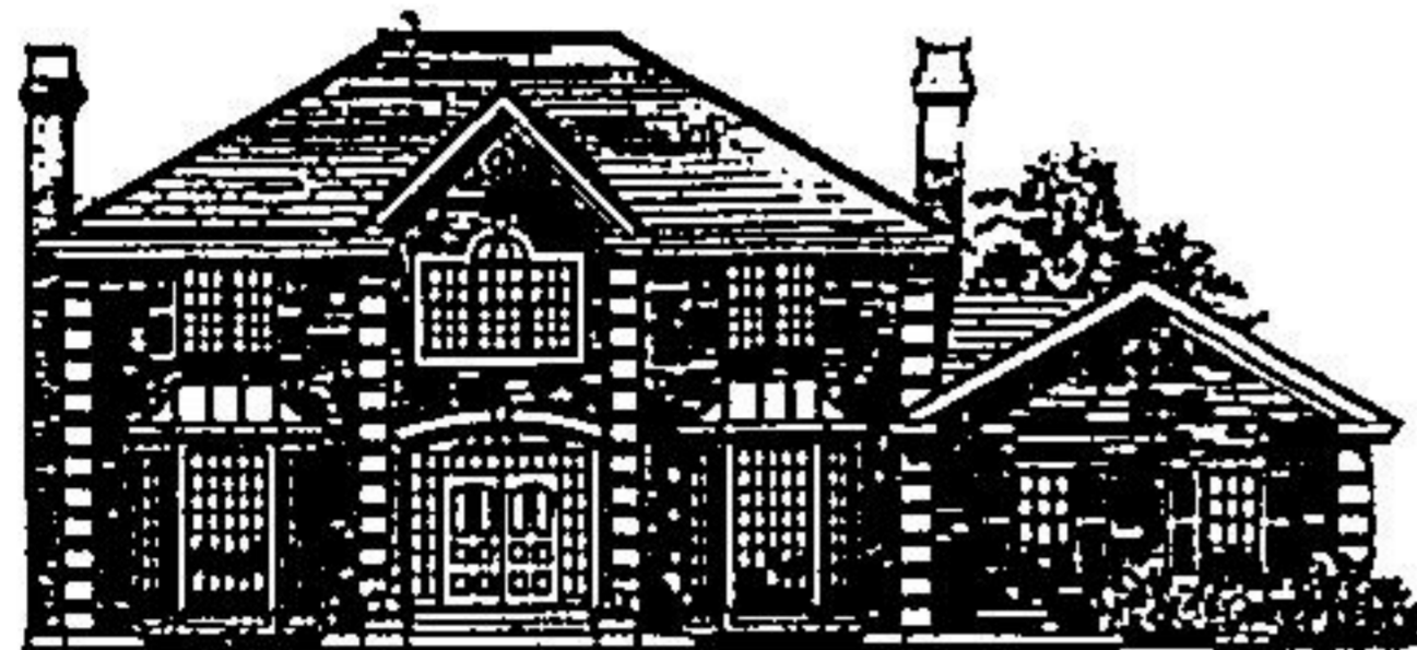
Plans include all exteriors shown