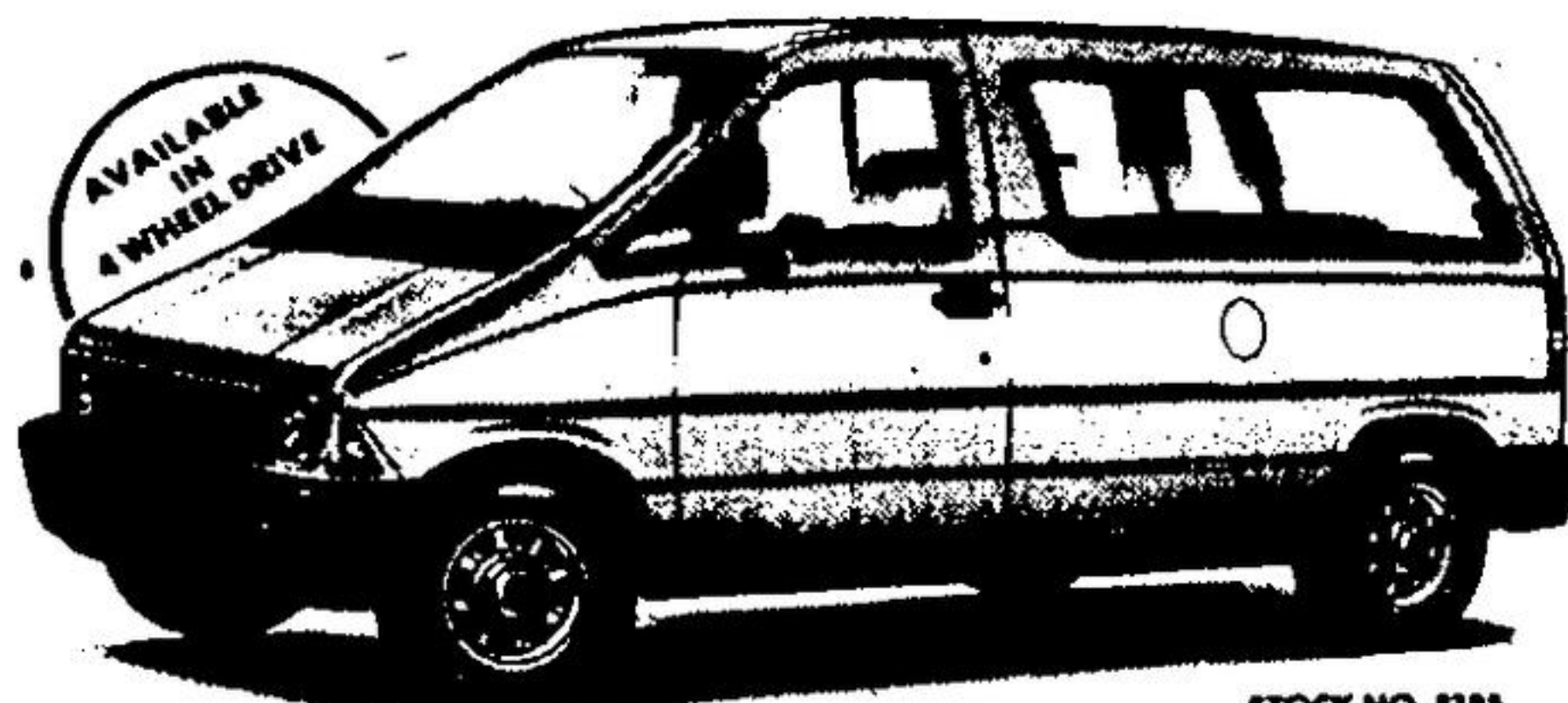
STOCK NO. 8183