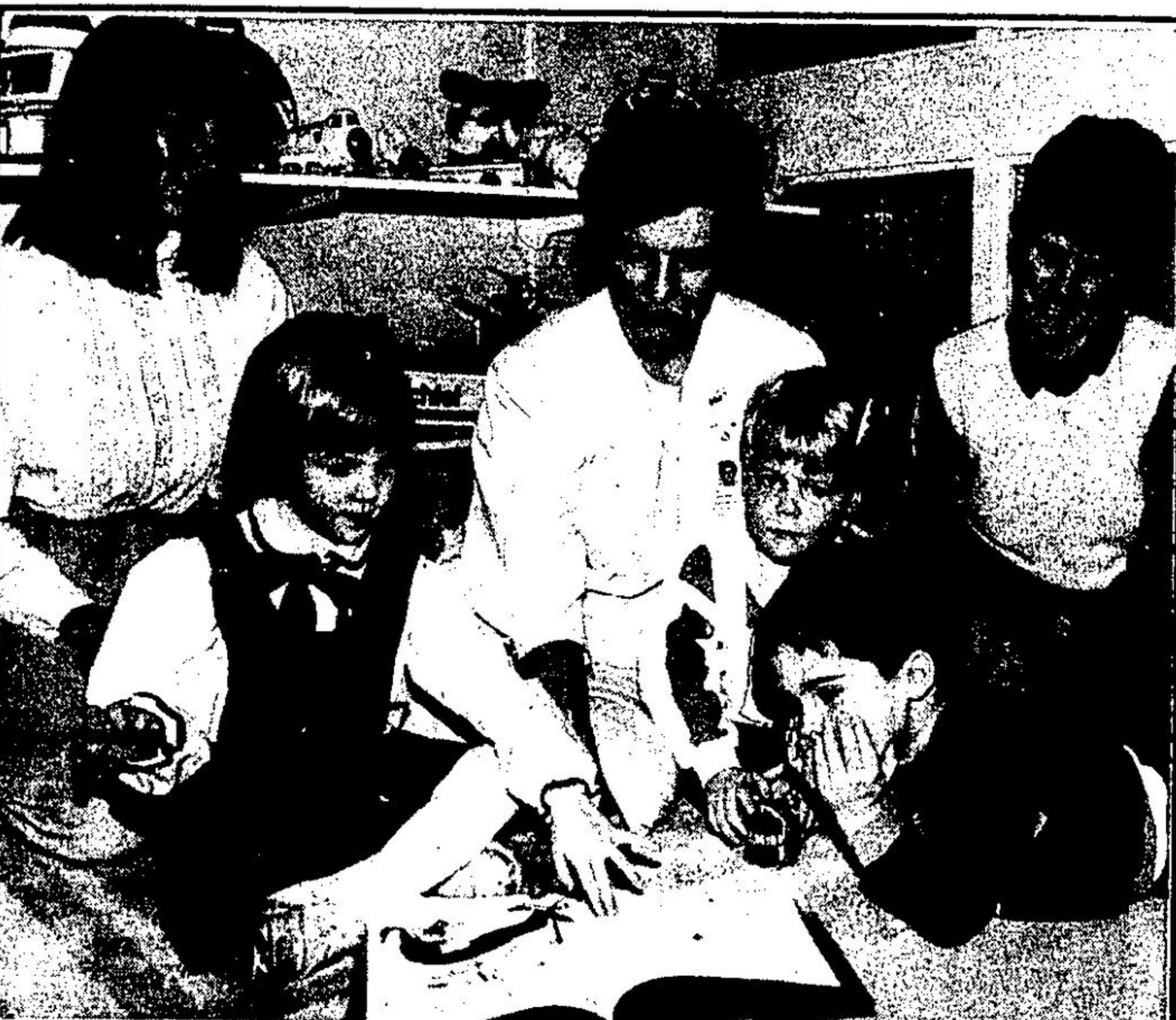
Day care youngsters project

To register, call SEVEC toll-free at 1-800-38-SEVEC. The deadline for registration is March 15, 1991.