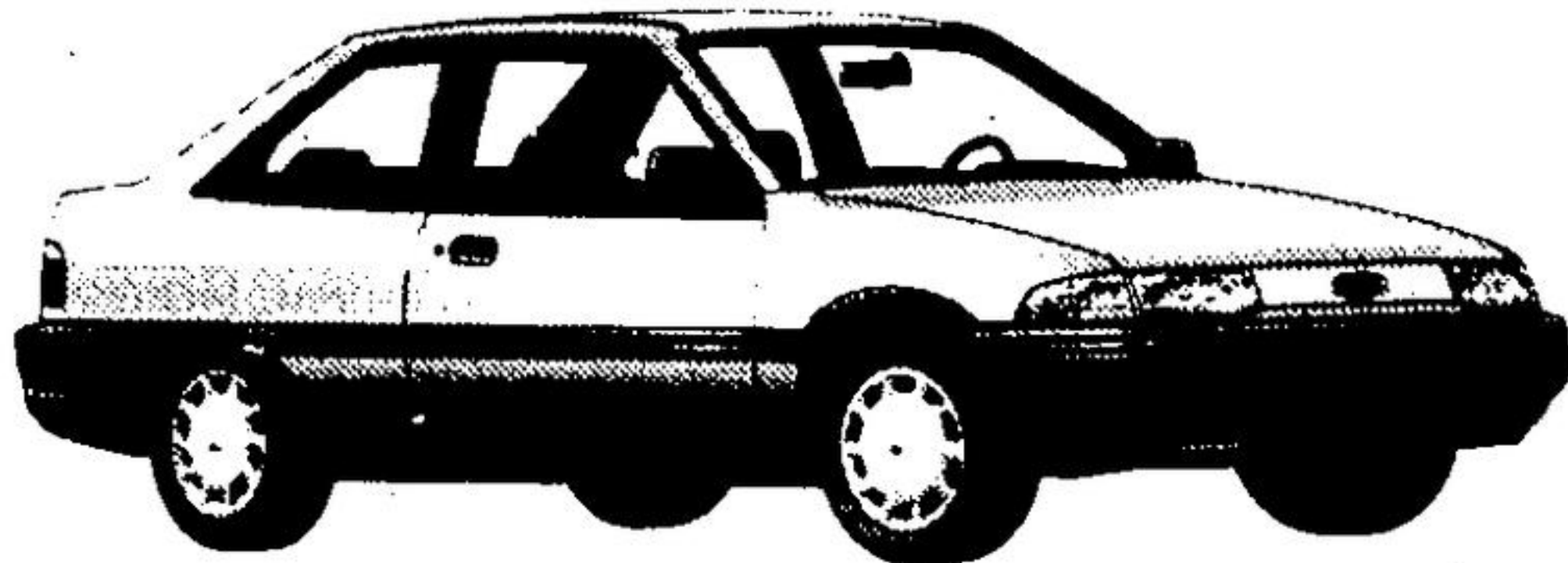
STOCK NO. 2149