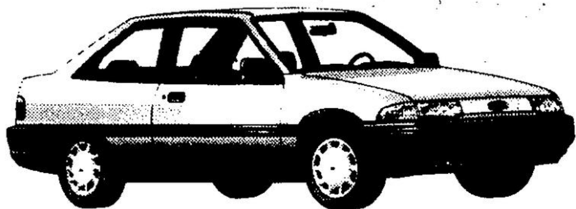
STOCK NO. 2149