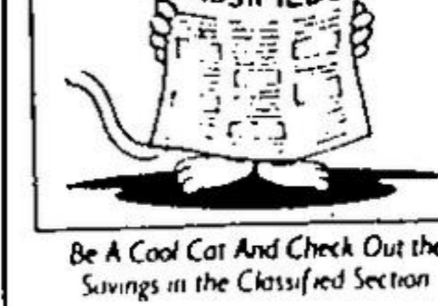
Be A Cool Cat And Check Out the Savings in the Classified Section

1986 Monte Carlo, auto, p/s, p/b, am/fm, bucket seats, console. All original, low miles. Immaculate condition. Certified. 853-2696 or 416-720-7692.