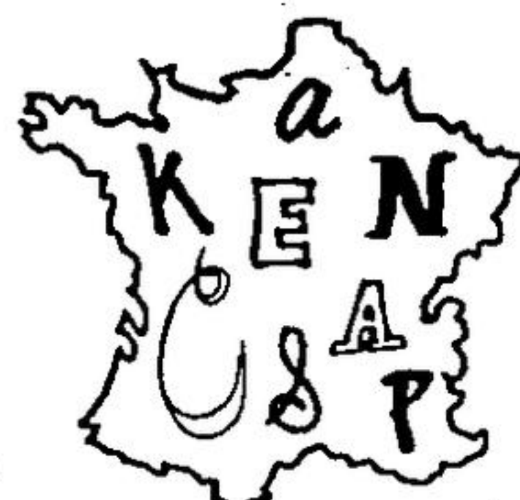
(Answers: 1. Germany - fish, 2. Switzerland - whipped cream, 3. France - poncakes)