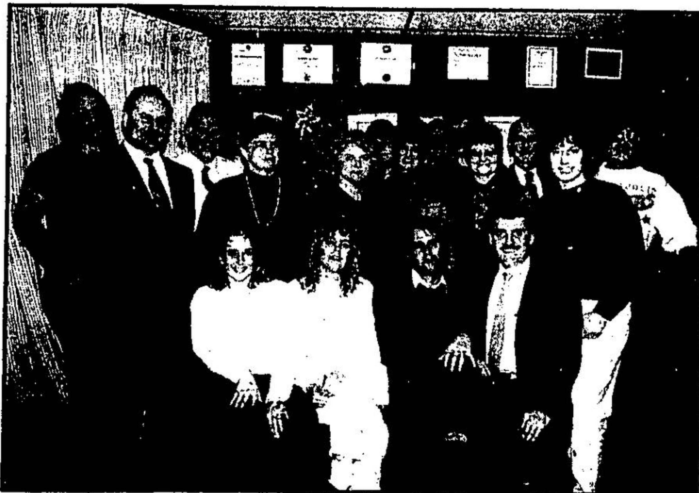
Best wishes for a happy holiday season, from all the staff at the Halton Hills Herald.

At this special time of year we'd like you to remember that it's a joy to know you and a pleasure to serve you!