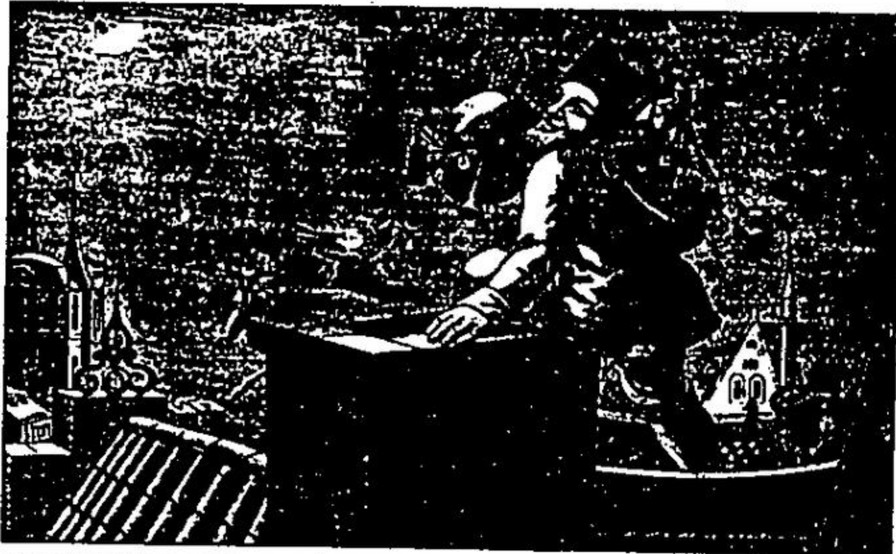
ONE OF THE EARLIEST ILLUSTRATIONS of Santa Claus is this one from The Great Pictorial Annual Brother Jonathan , dated January 1, 1845. The reindeer and sleigh were already part of his image, though the great white beard and face full of wrinkles were still to come.