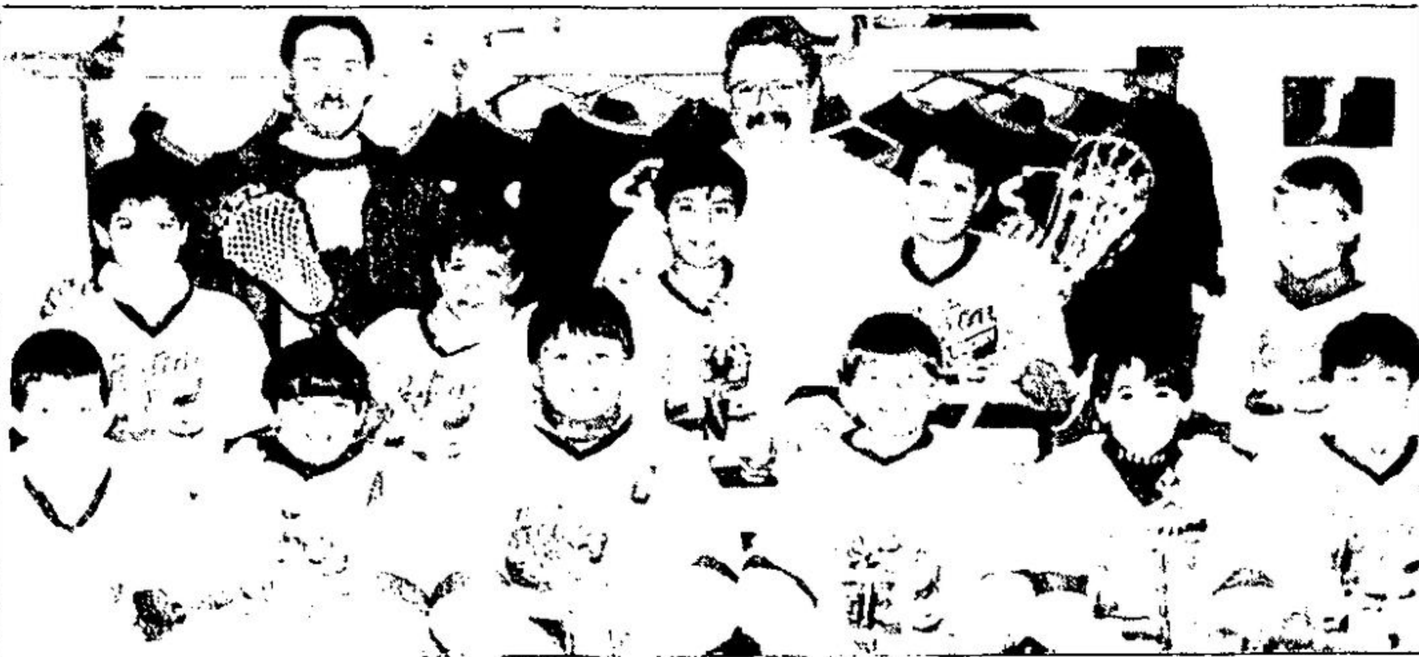
Members of the Acton Novice Leathertown West Wearhouse Sabres pose for a team picture at the Acton Arena Wednesday. The group, which also plays lacrosse together, is a force to be reckoned with, having gone undefeated in 20 games and winning two tournaments. From left to right, back row,