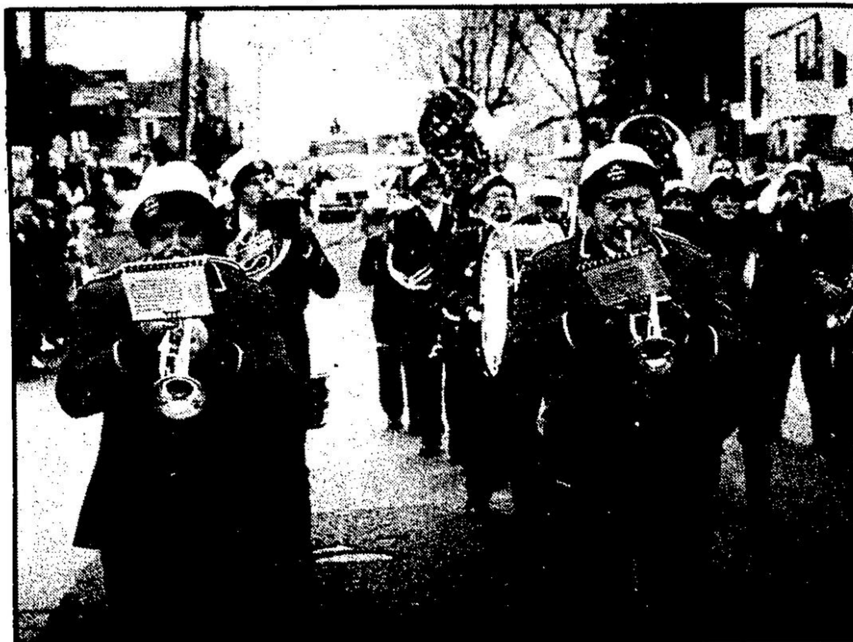
The Acton Citizens Band provided lively and seasonal renditions for marchers of all ages during