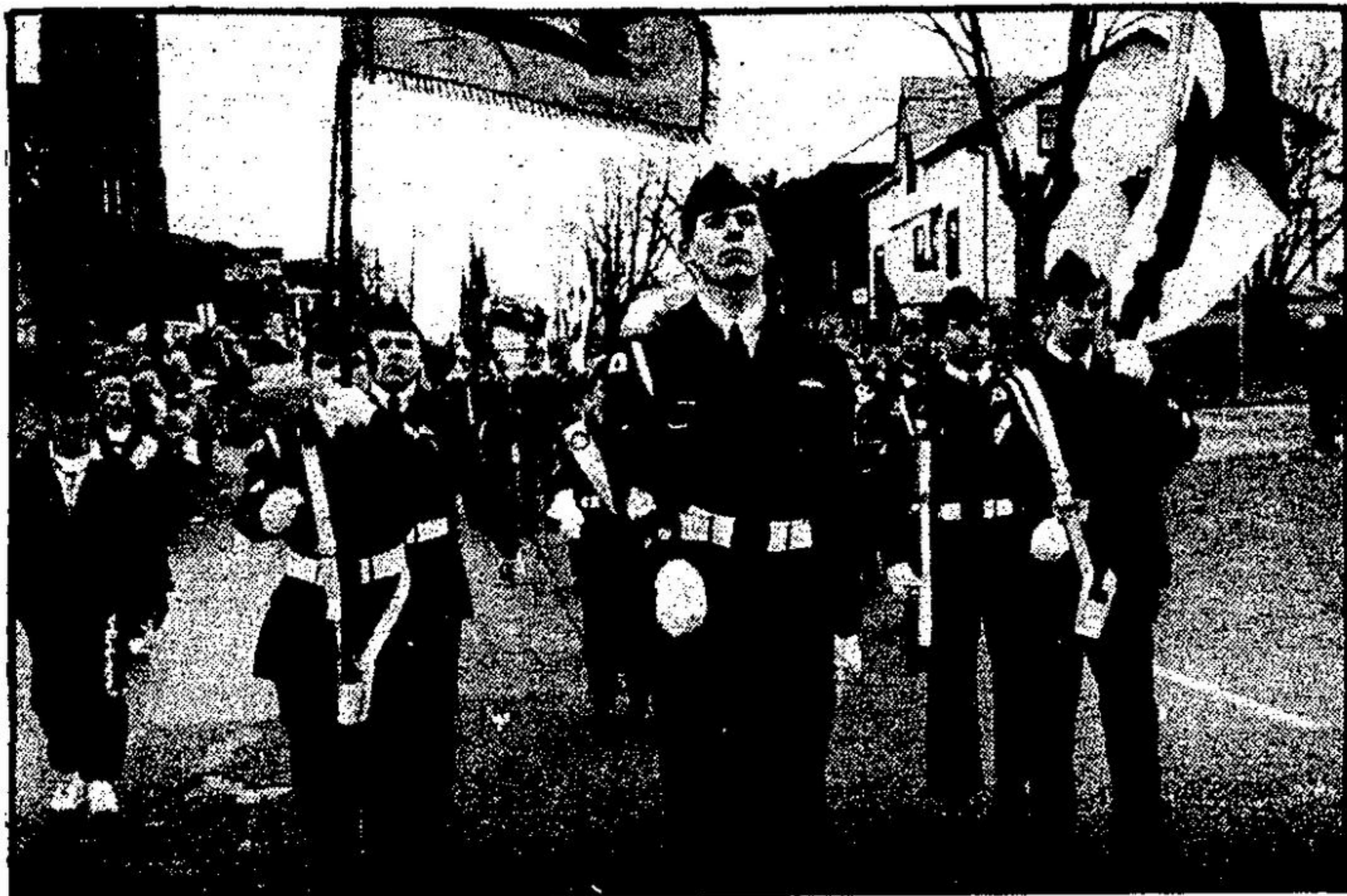
Georgetown Branch 120 Royal Canadian Legion-sponsored 756 Squadron Air Cadets impressed

onlookers with their smart appearance and snappy marching style at Saturday's Santa Claus Parade.