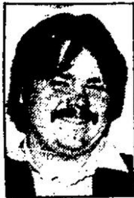
RISKY BUSINESS By Rob Risk

The recent decision by the shareholders of the North Halton Golf and Country Club to turn down a proposal that would allow for expansion of the facility is one that has me puzzled.