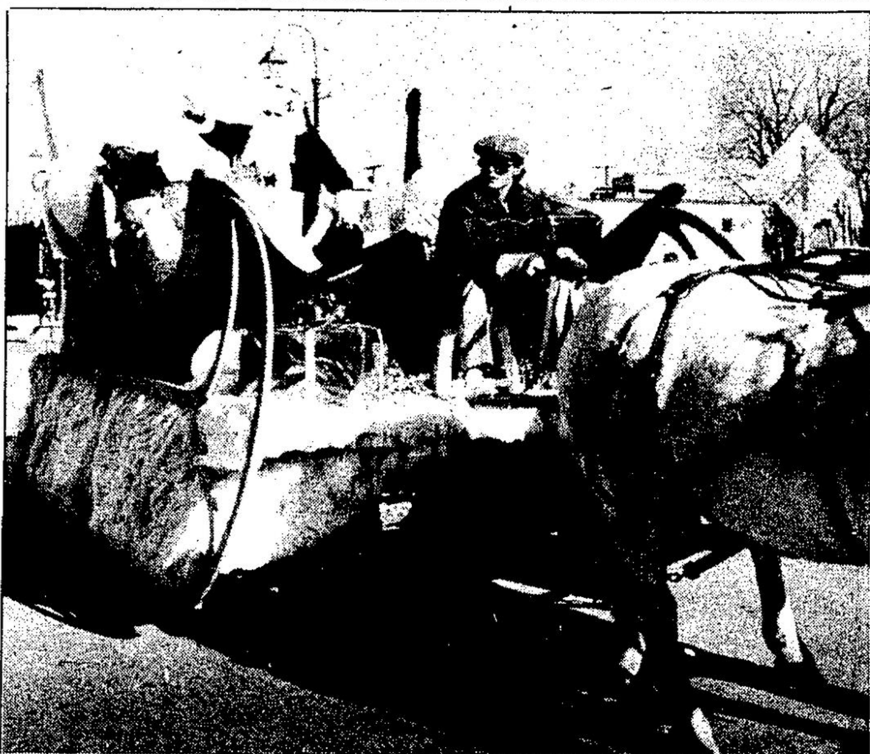
Santa Claus came to Acton to take part in the annual Christmas parade on Saturday. As always, he was the last in line and the most anticipated.