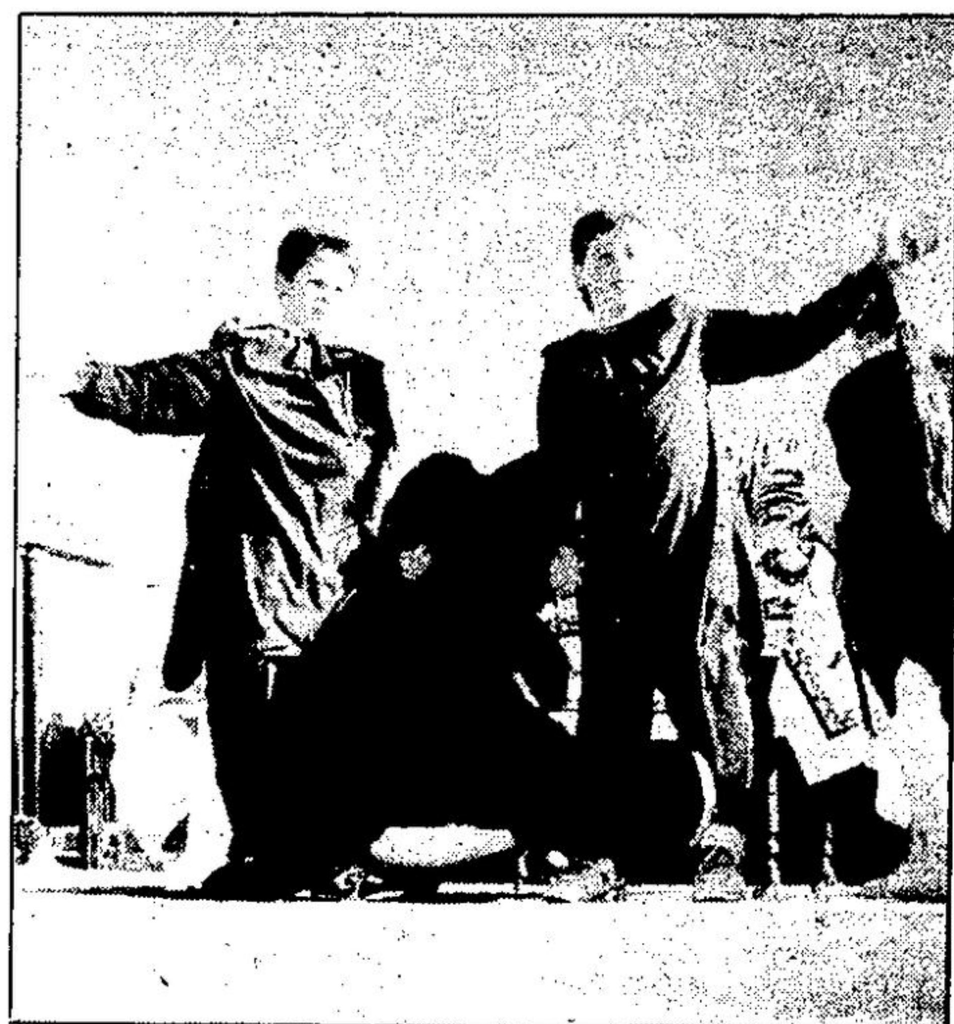
Two students from McKenzie-Smith Middle School wave to the crowds of people who came to watch the Acton Christmas parade on Saturday.