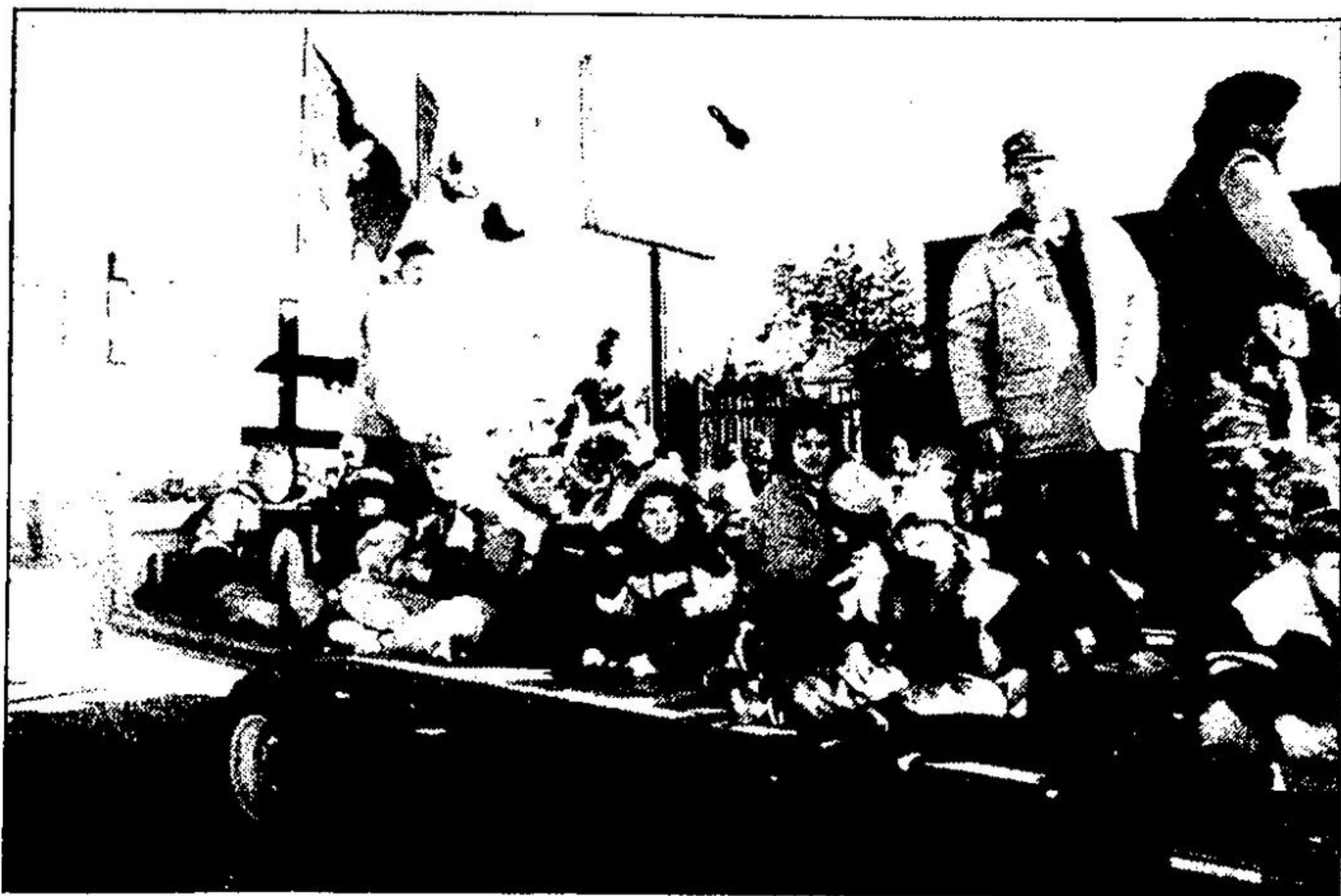
Some Beavers from the Acton Boy Scouts enjoy a Christmas parade.