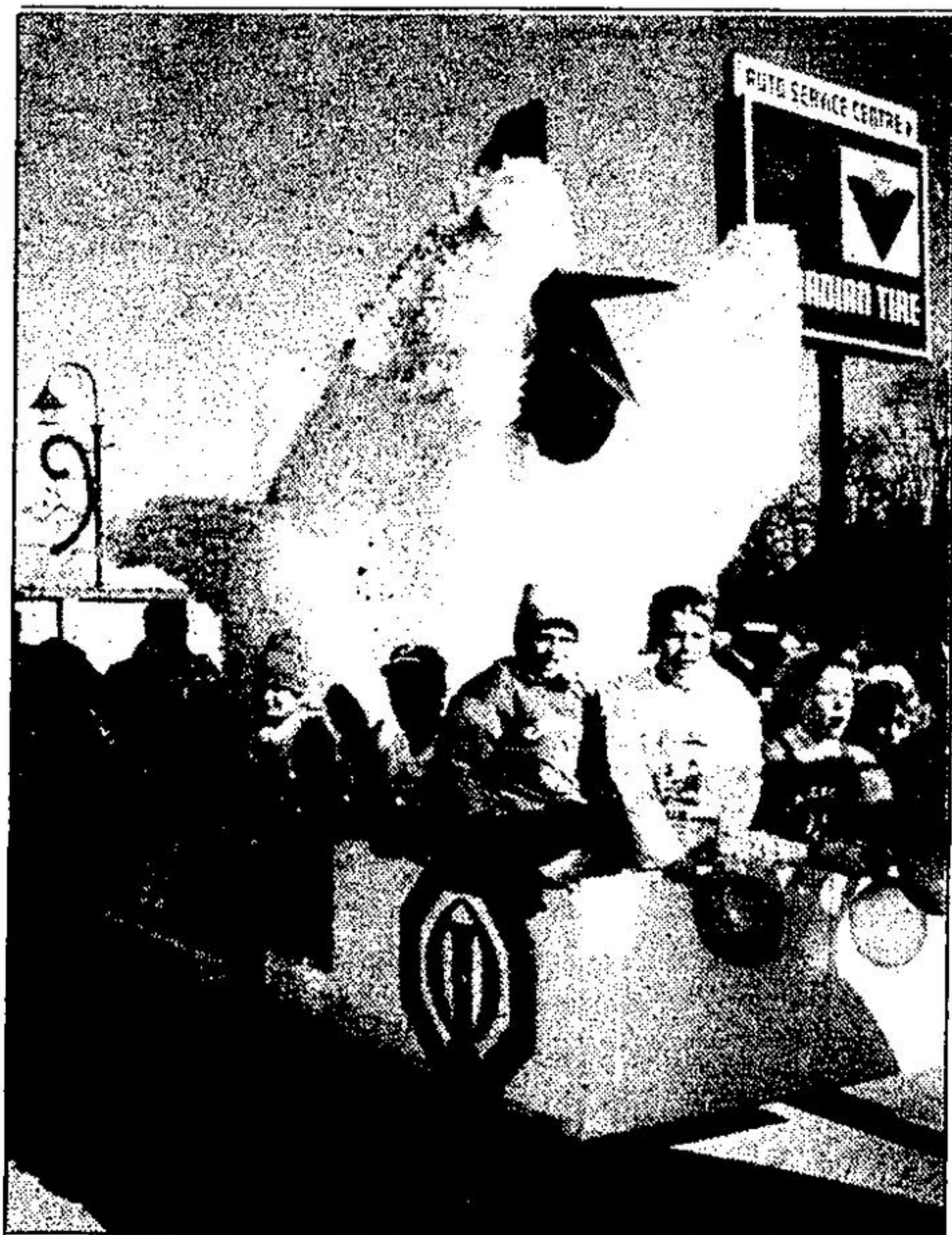
The Acton and Georgetown Optimist Clubs banded together to enter a float in this year's Acton Christmas parade on Saturday. The eye-catching chicken was built by the Georgetown group and the rest of the float by the Acton members.