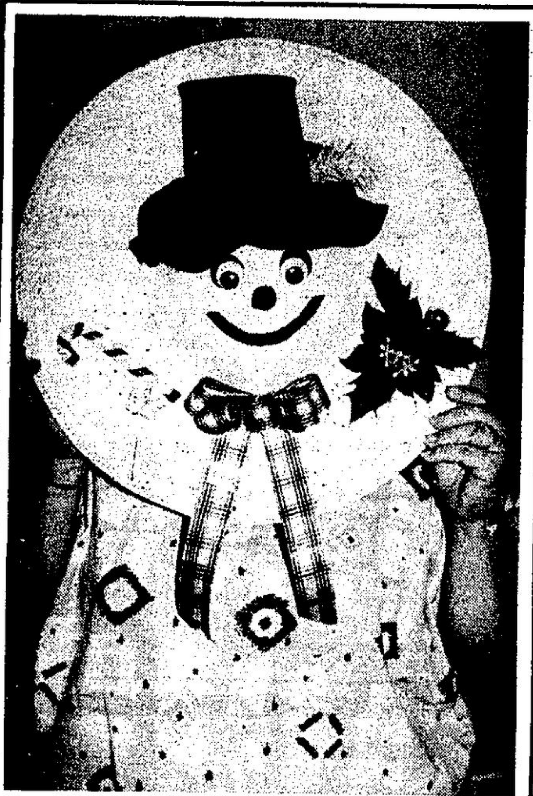
'Frosty The Snowman'