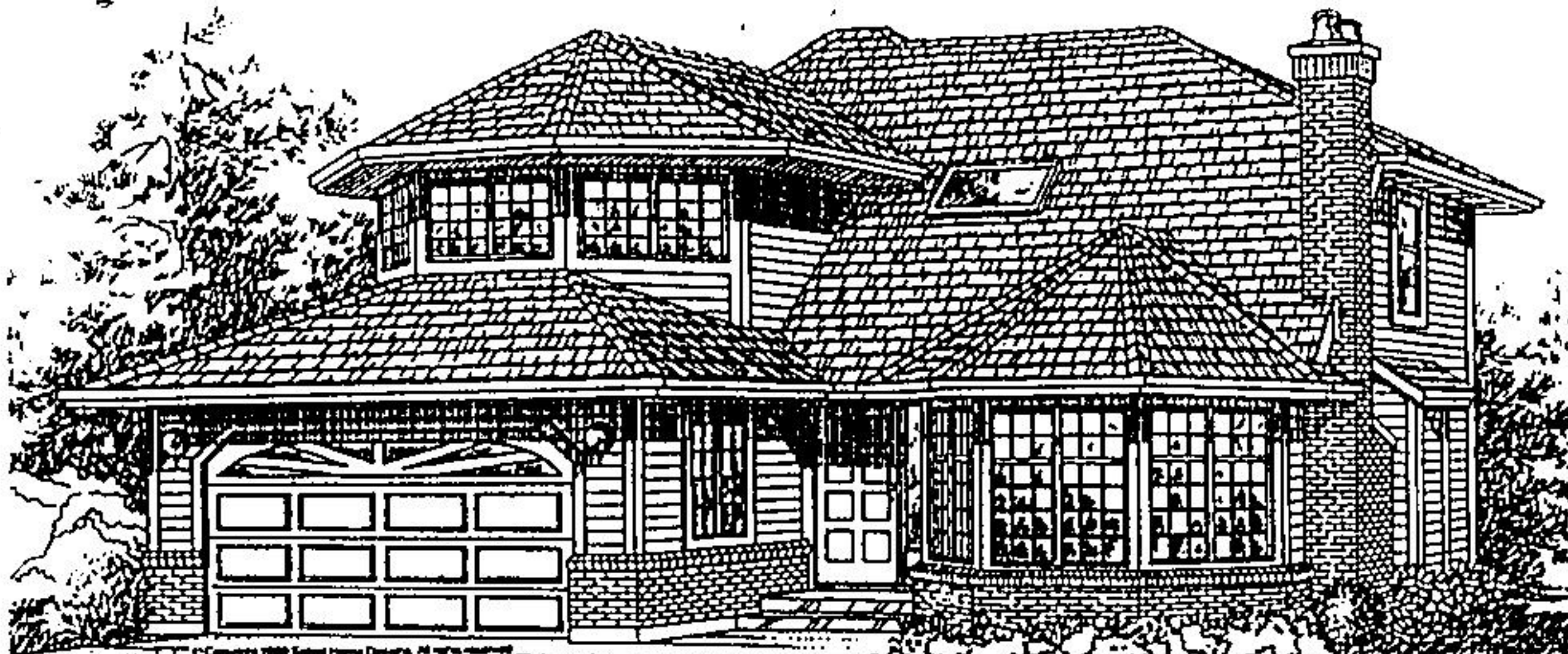
PLAN NO. 1989-2145