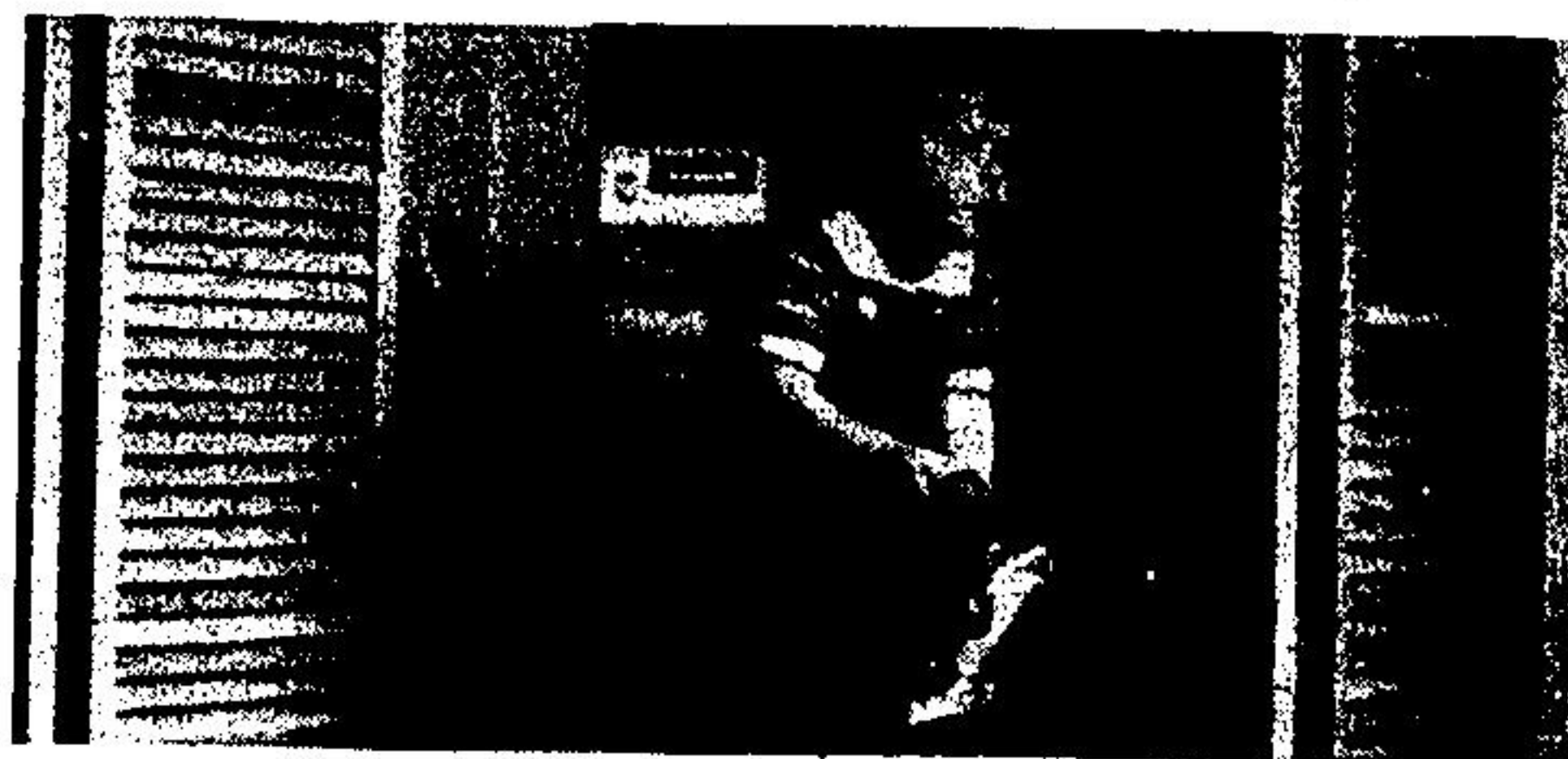
THIS WINTER, give your family a breath of fresh air with a Honeywell electronic air cleaner.