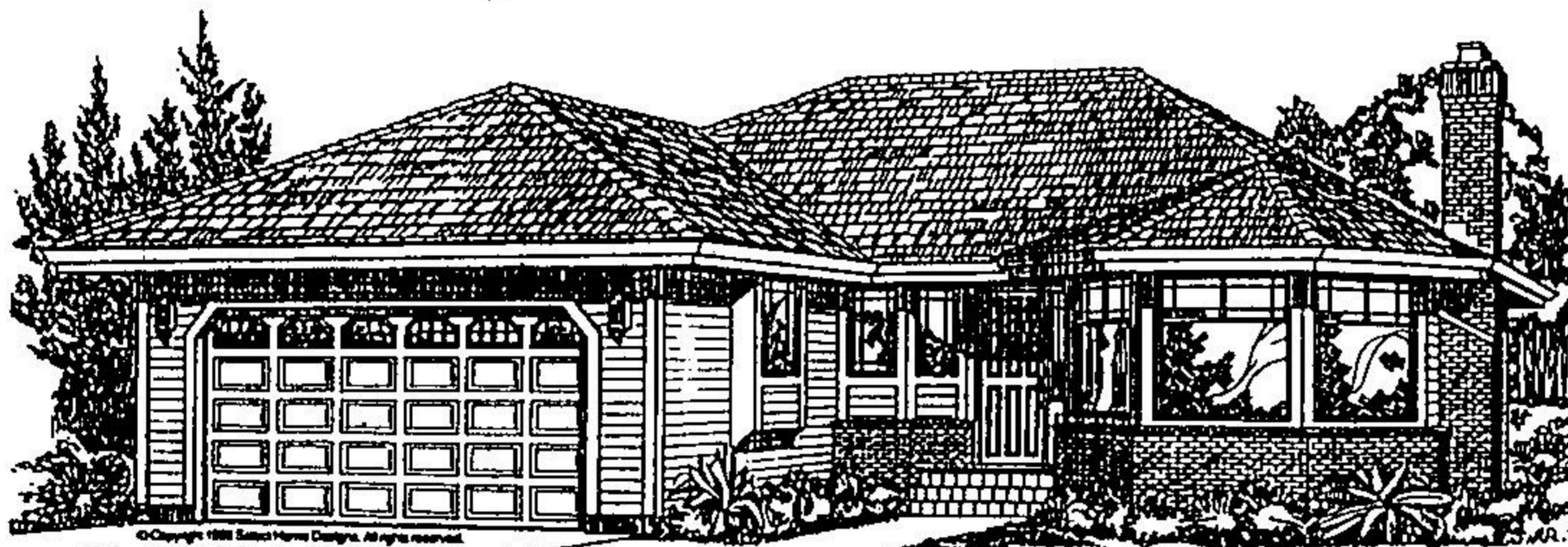
PLAN NO. 1688-1495