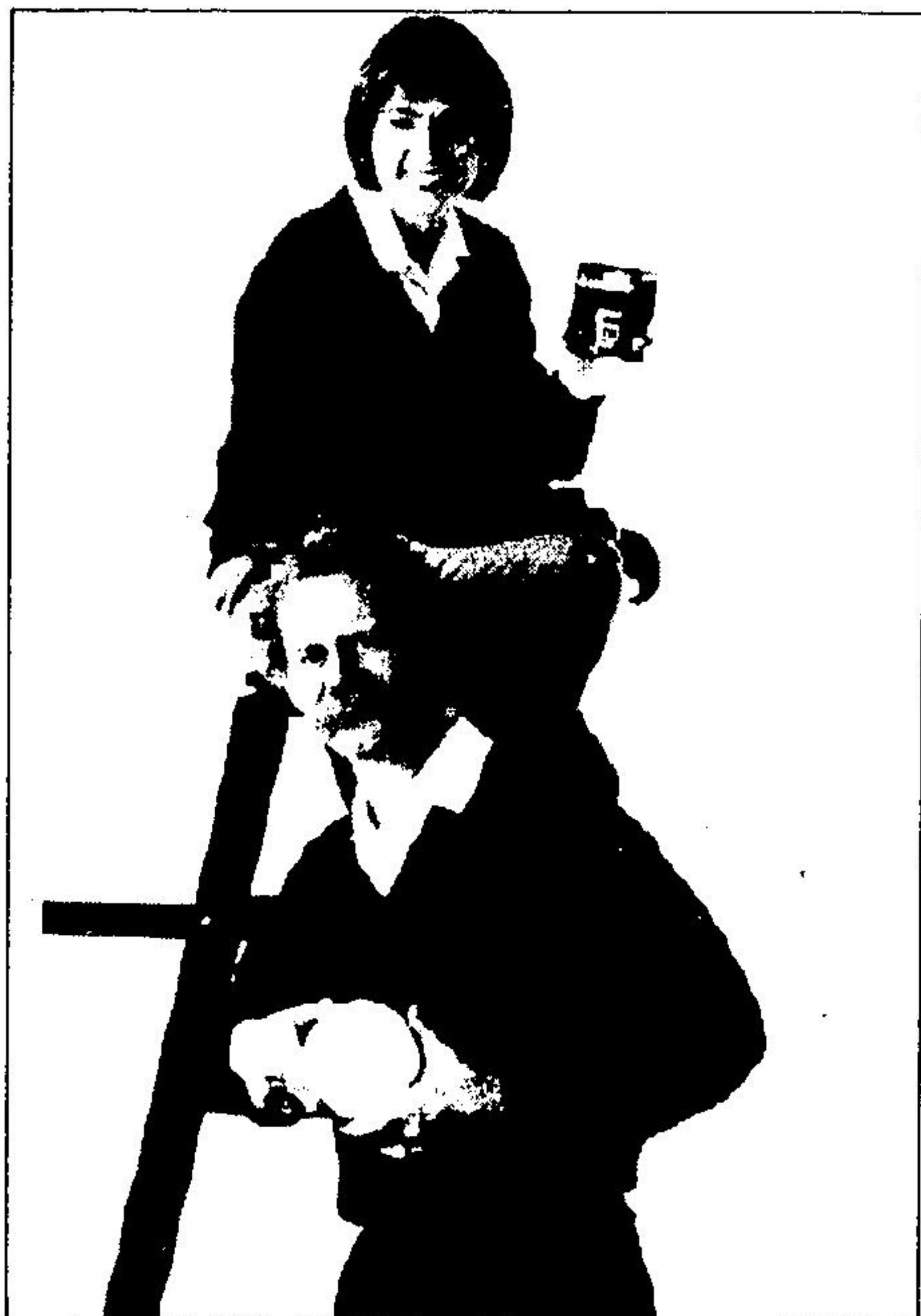
Sylvie Bernier and Lanny McDonald remind you to "Change Your Clock, Change Your Battery".