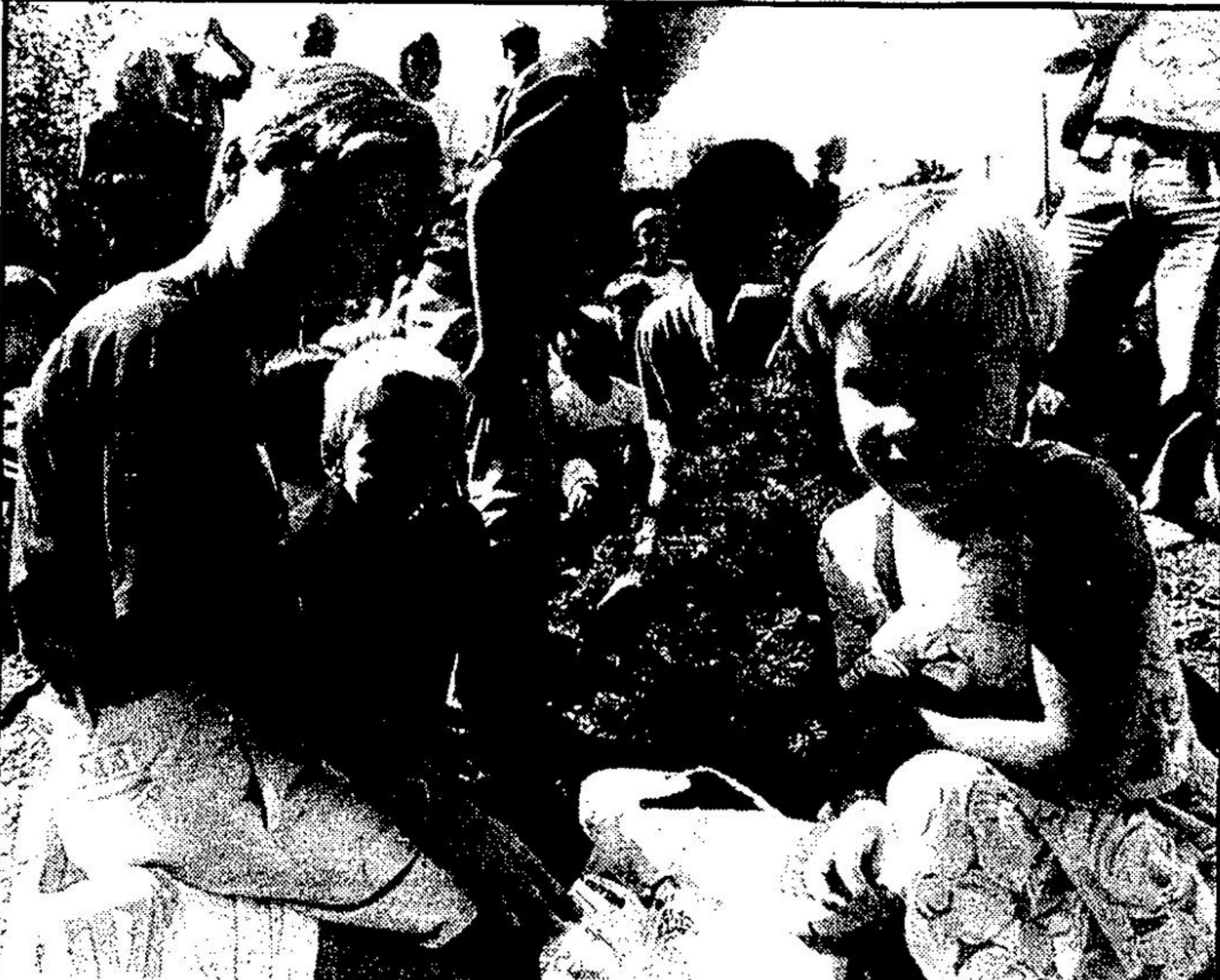
Students from Harrison Public School participated in the planting of a tree to celebrate the 20th anniversary of TV Ontario. Grade 5 students dedicated the tree to the Grade 1 students as an act of kindness and