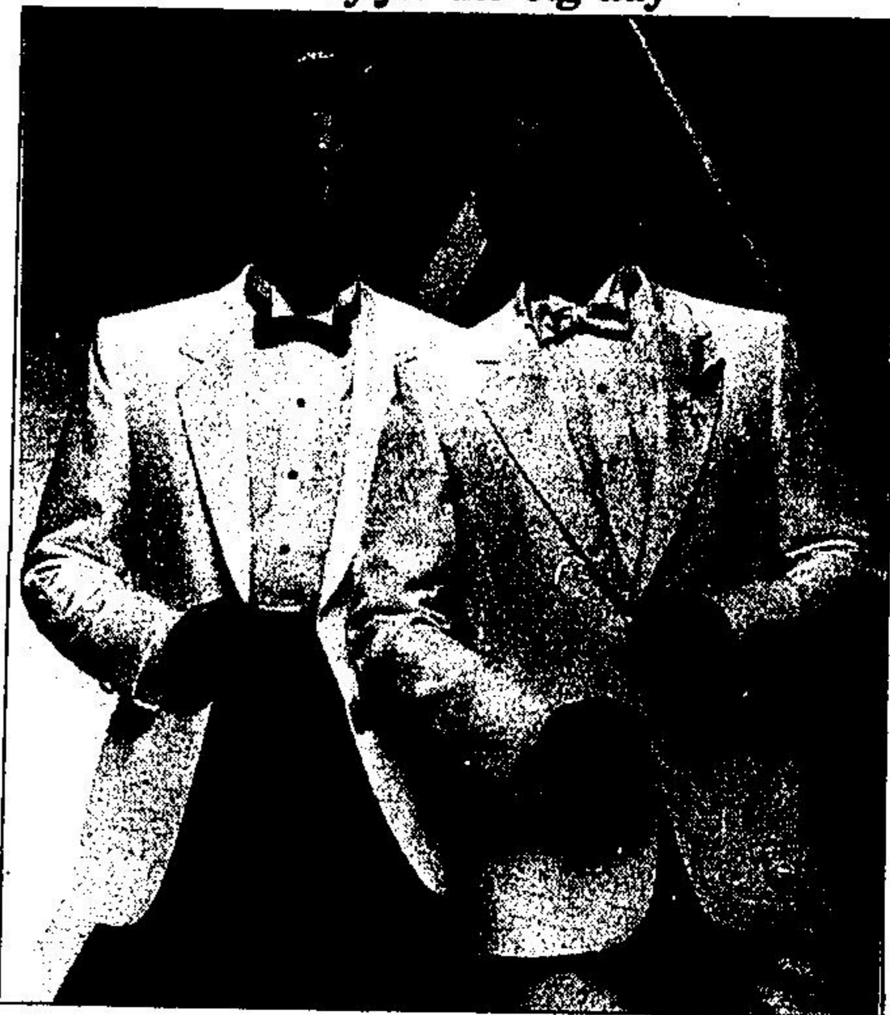
Ready for the big day

Confetti and curled ribbon added to the balloon drop will certainly add festive flair. The balloons of course should be co-ordinated to the chosen colors of the wedding.