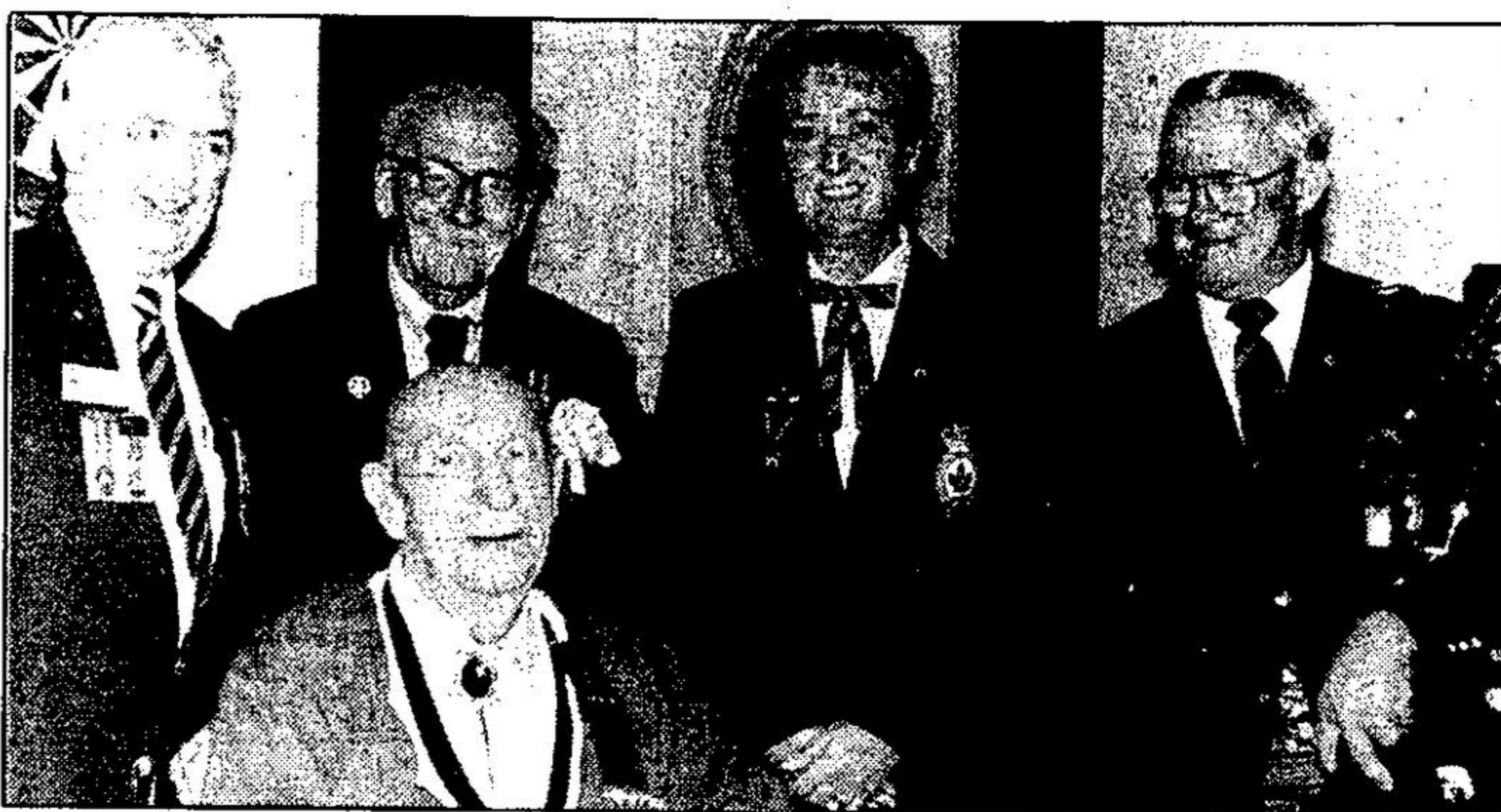
Georgetown Branch 120 Royal Canadian Legion hosted its annual veterans visit Sunday afternoon. Every year, veterans from Sunnybrook Hospital are invited to enjoy the afternoon at the Georgetown Legion with some of its members. Pictured above,