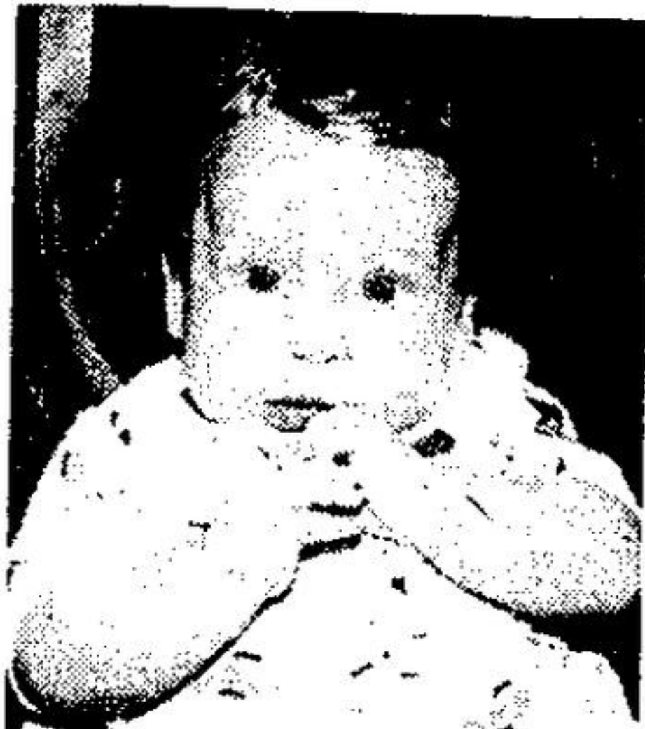
Our new hope

Do you ever look into the eyes of something young and absolute? Living on a farm gives me ample opportunity to do just that - every day. It could be the eyes of the newborn calves and foals or metaphorically, the newness of the sprouting crops, the clear water from the melting snow. We see hope when we farm and for many, it is the reason we continue to do so - even when the times economics dictate we should not. The hope is in the planting, the nurturing and the harvest; whether it is crop or livestock.