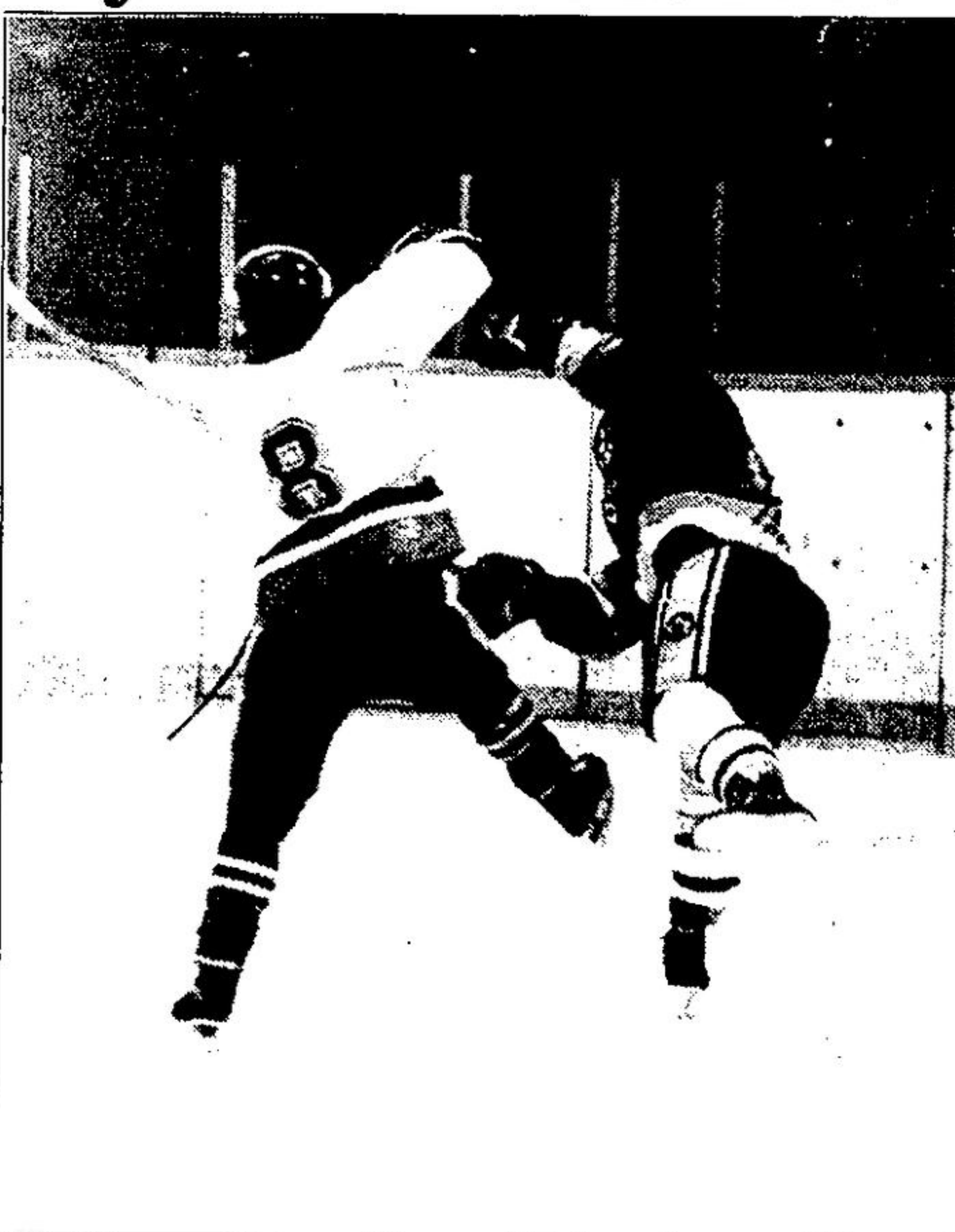
An Acton and a Mount Forest player vie for position during an exhibition match at the Alcott Arena on Friday evening. The opening game of the year for the Sabres didn't go well, as they dropped a 3-1 lead in the third period to lose 4-3.

The Sabres are scheduled to play Thursday night in Flamborough and then the next night against Stayner at Alcott Arena. On Monday, the team travels to Schomberg, before returning to Alcott for a match against Flamborough on Friday and their final pre-season game on Sunday in Mount Forest. The Sabres' regular season begins Oct. 5 when they play Alliston at home, starting at 8:30 p.m.