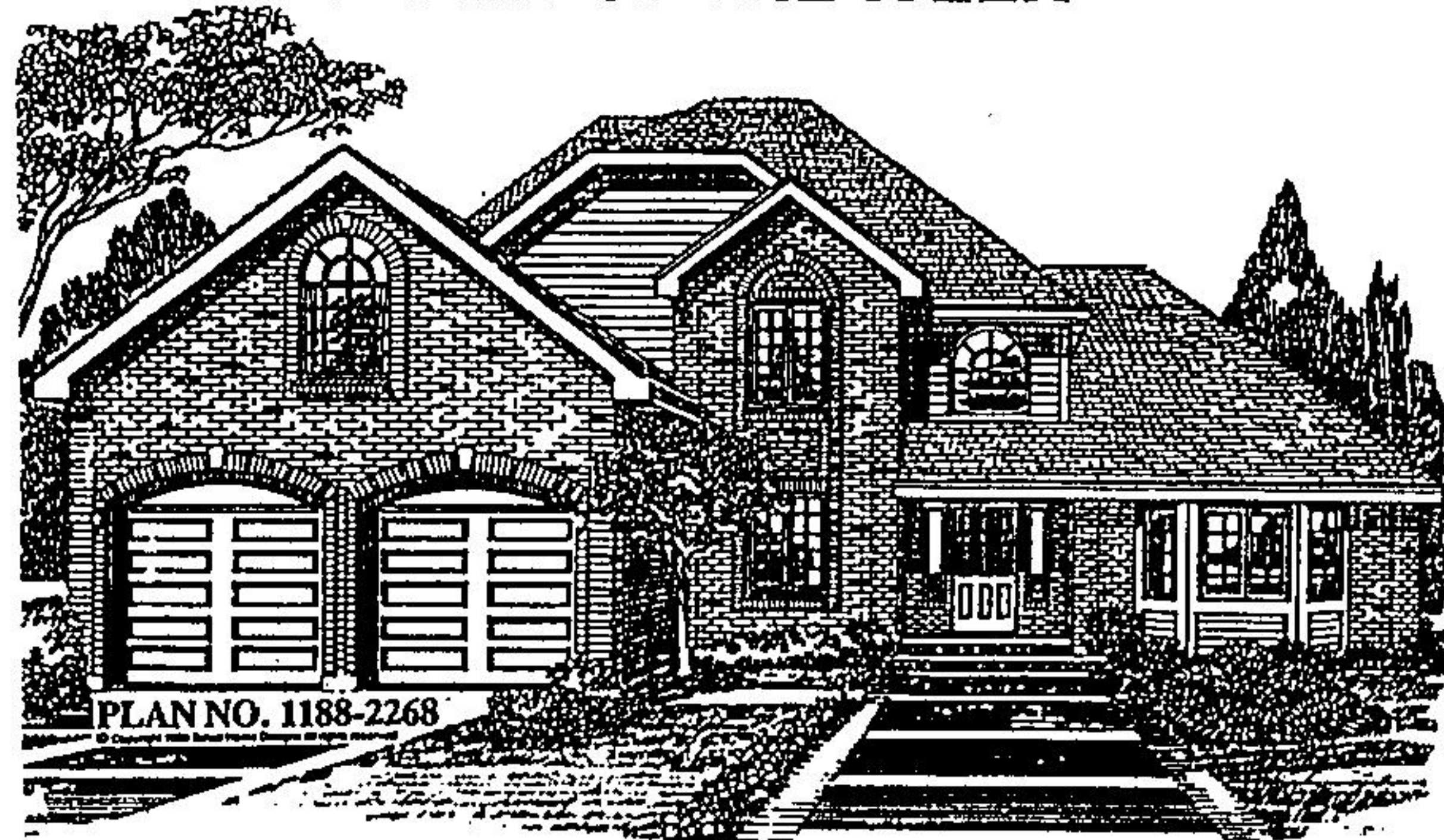
PLAN NO. 1188-2268