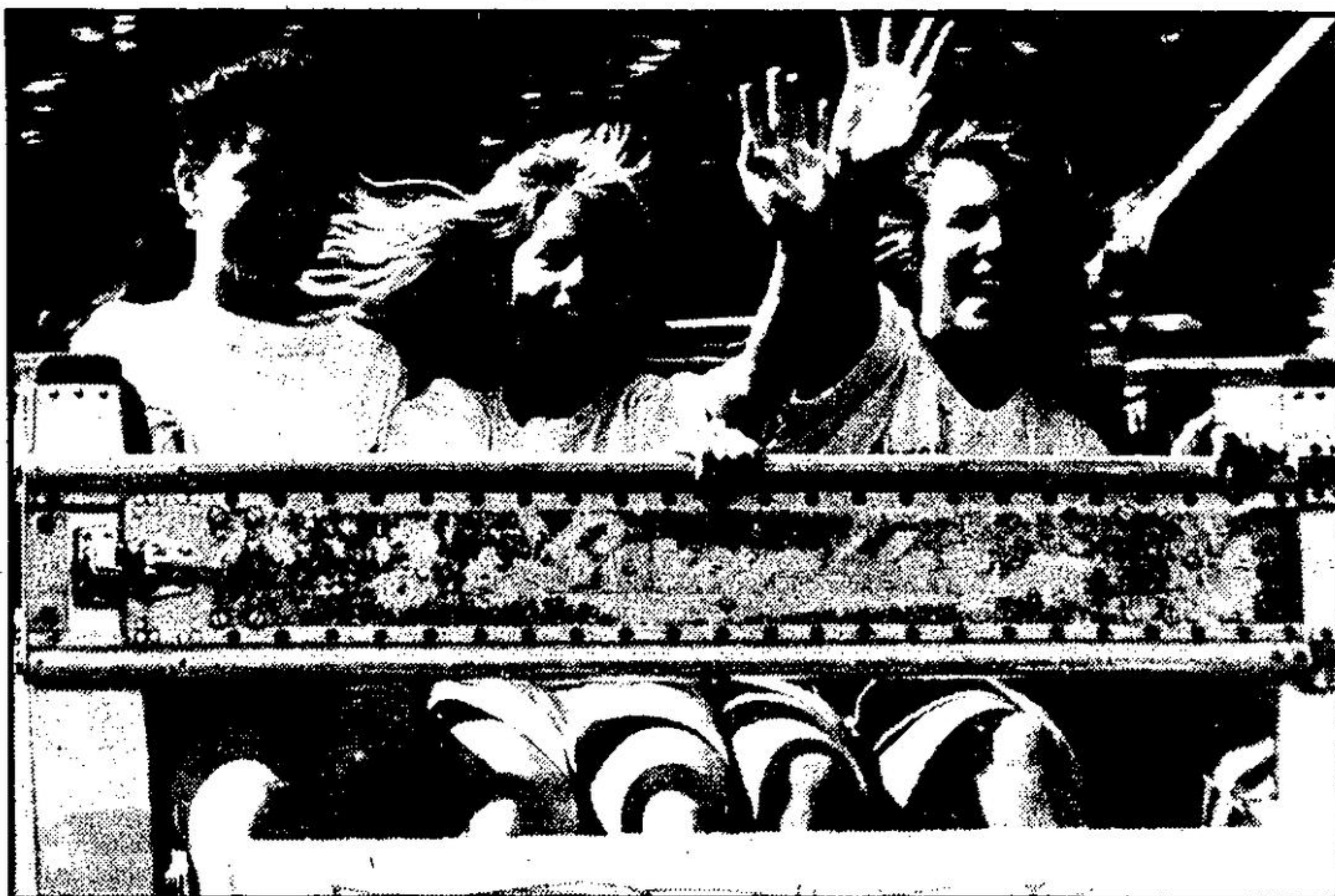
These three Georgetown girls got caught in midair by a Herald photographer while being whipped about by a midway spider ride.