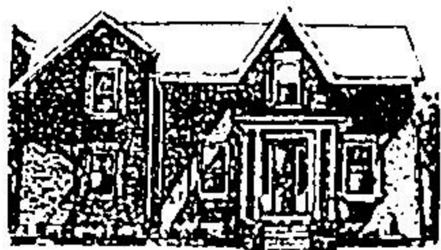
THE INSURANCE HOUSE

A Complete Line Of *HOME *AUTO *APARTMENT *BUSINESS *CONDO *BOAT