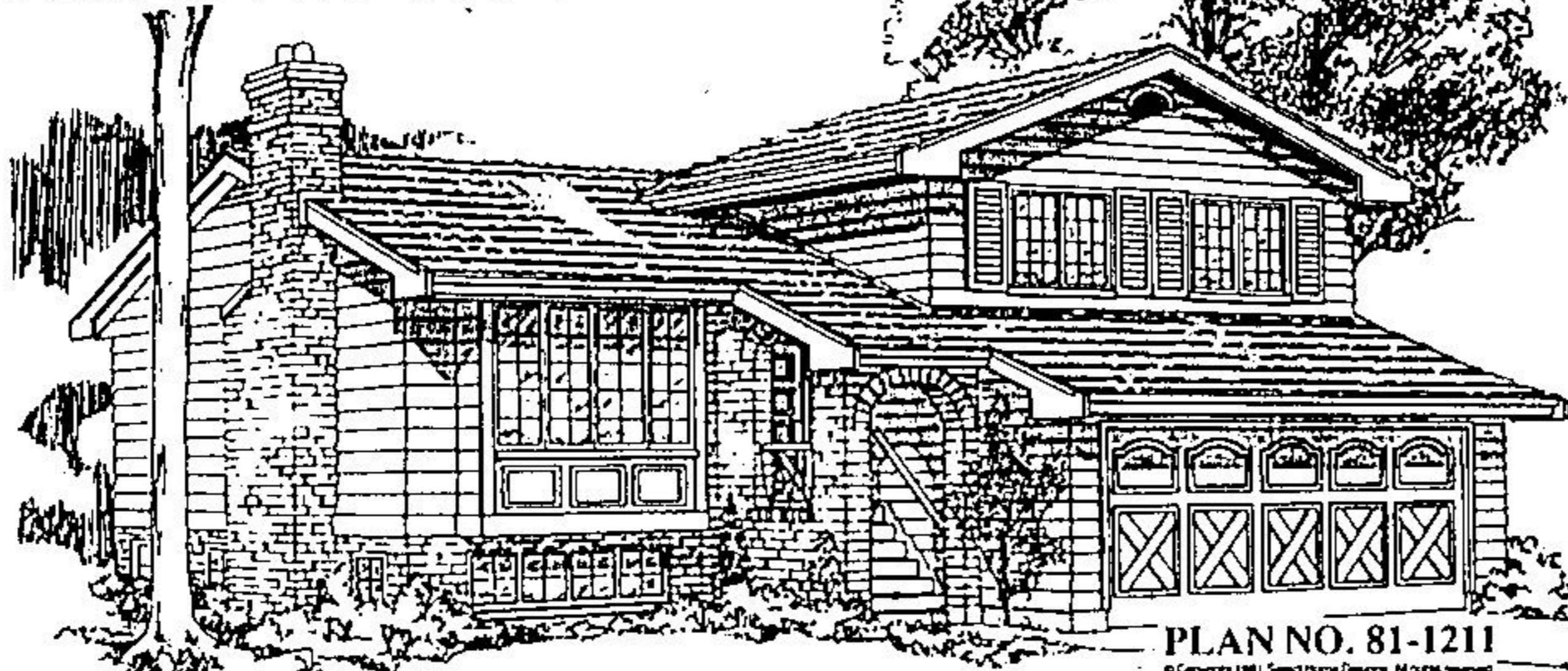
PLAN NO. 81-1211 © Copyright 1981, Small Home Design, All rights reserved.

TRI-LEVEL HOME DESIGNED FOR FAMILY RECREATION.