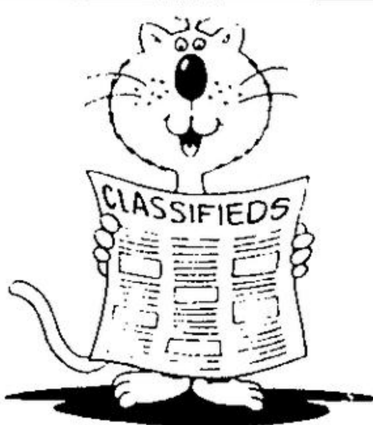
Be A Cool Cat And Check Out the Savings in the Classified Section.

Pony - Buckskin Arab/Welsh Filly, 2 years. Dark mane and tail. Nice nature. 877-1195. (es)