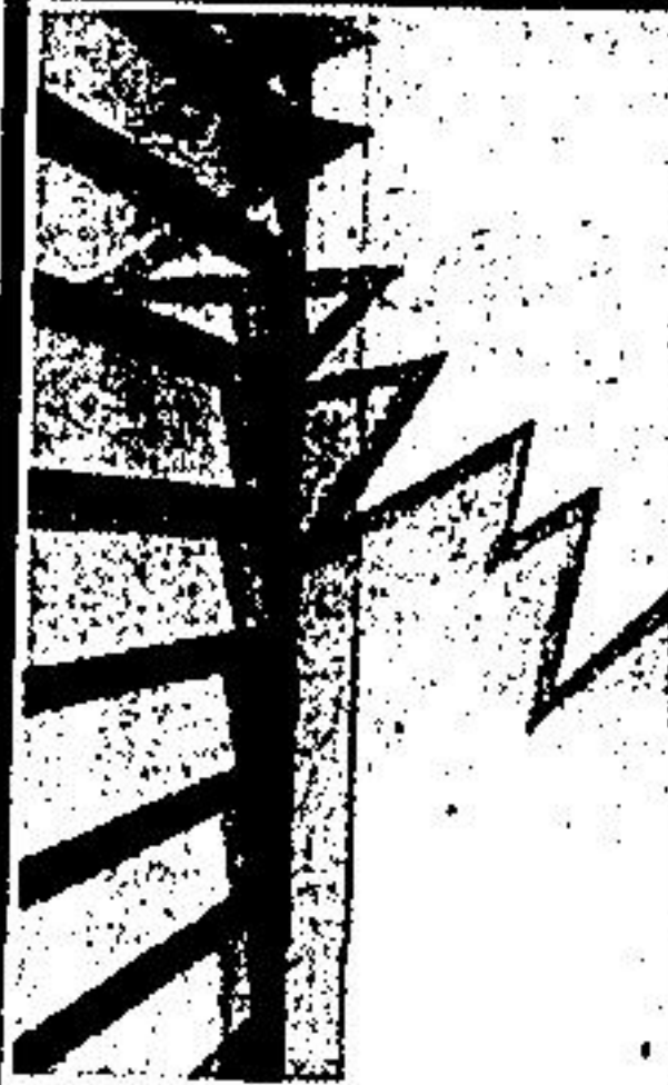
Ultraviolet Sun Rays