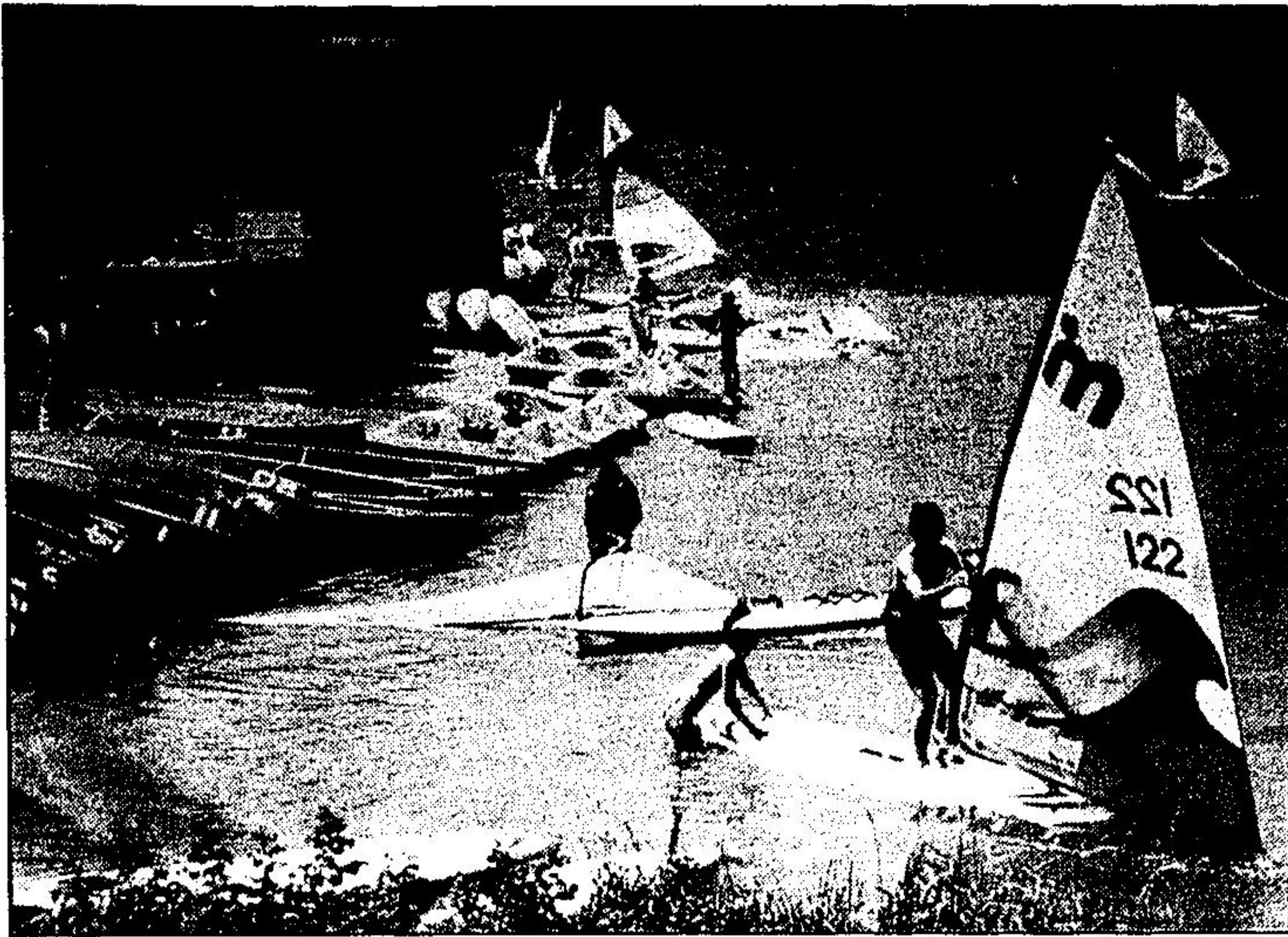
Here some visitors to Kelso partake in some of the various water activities the Conservation Area has to offer.