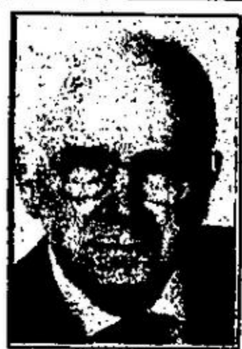
Vince Egan Travel

If you are headed for a transatlantic holiday in Britain or on