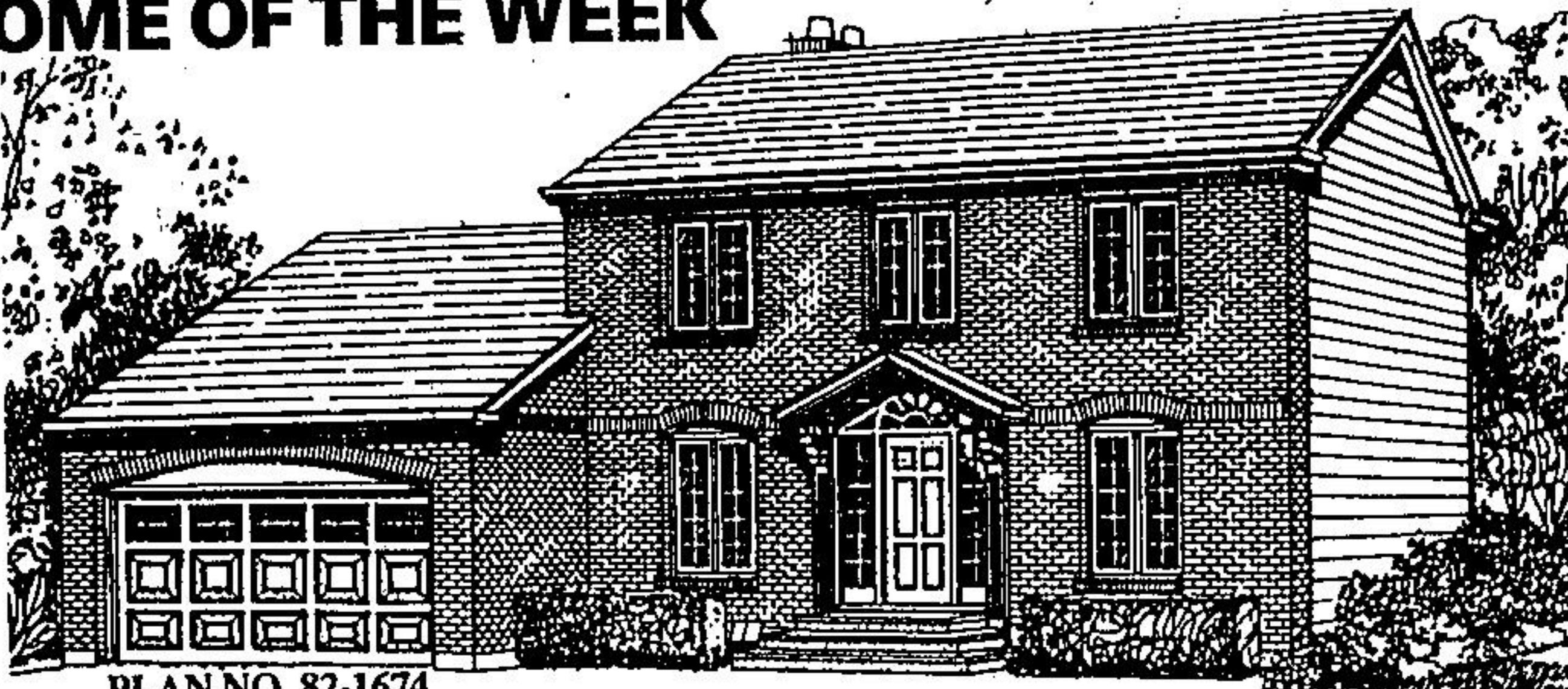
PLAN NO. 82-1674