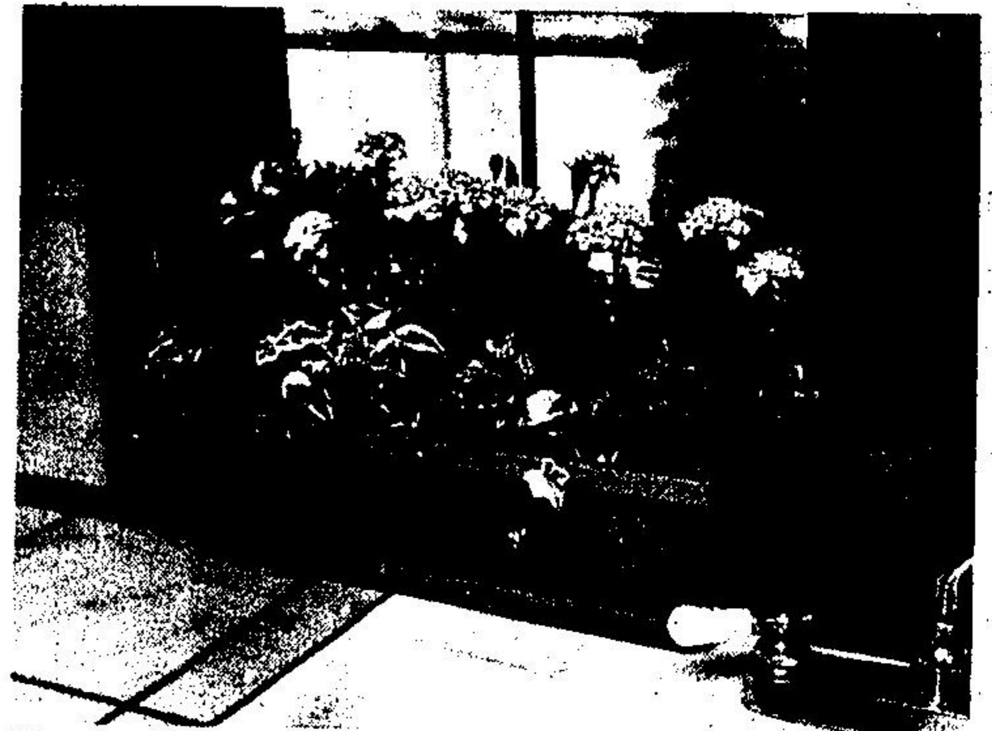
WINDOW BOXES can mask a dull or uninspired view. On any windowsill they add color, cheer, even something for the salad bowl.

Terra containers are available in three colors: Terra Cotta, Desert Sand and Granite. A full range of three sizes are available in boxes and baskets, four sizes in bowls, and nine sizes, from 4-inches to 24 inches, are offered in the traditional pots.