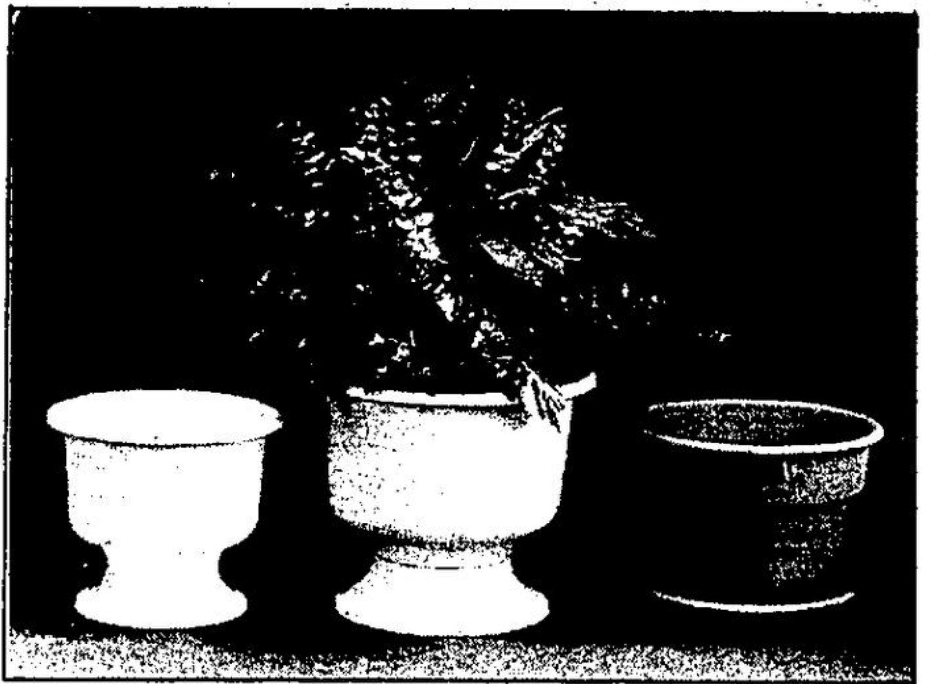
ADD COLOR AND CURB APPEAL to the front of any home, with Garden Scene's new Contemporary Urn (left) and Dura Cotta® (right) planters. When the urns are filled with geraniums, vinca vines and asparagus ferns, and combined with flower-filled Dura Cottas, a warm, homey feeling is created.

To add curb appeal to your home the easy way, take a tip from the Garden Scene experts. Try container gardening in your front yard.