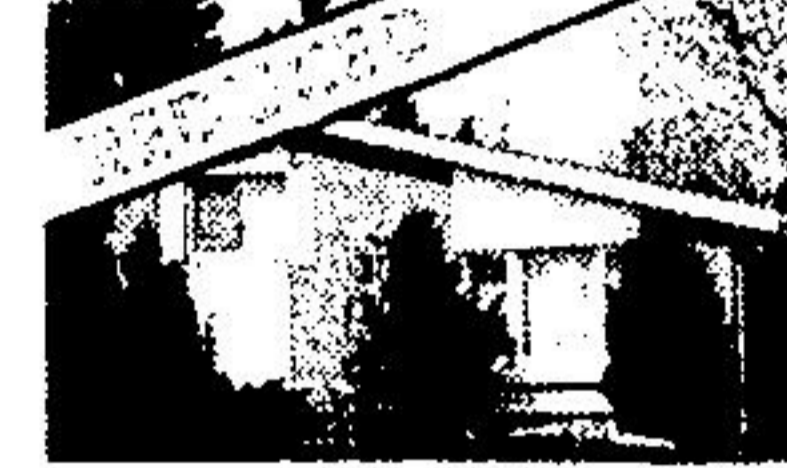
REDUCED - $172,900

Entertaining is part of the real joy of owning this home! Boasts 4 bedrooms, 3 washrooms, 2 way fireplace separates living and dining room, with walkout to deck. Loaded with many extras too numerous to mention. $339,500. For further details or to view this beautiful country executive home, please call Joanne Vranic, Sales Rep. 873-3377 or (519) 853-0336. CW2889