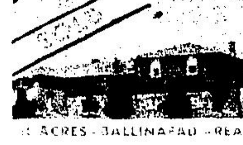
1 ACRES - BALLINAFAD - REA

A must to see is this beautifully kept 4 bedroom home in Calvert Dale. Close to schools and shopping plus a 1 bedroom in-law suite in the basement with complete walkout. Just give me a call and I'll be happy to show you through. David Barrager, Sales Rep. 873-3377 or 877-5313. CW2873