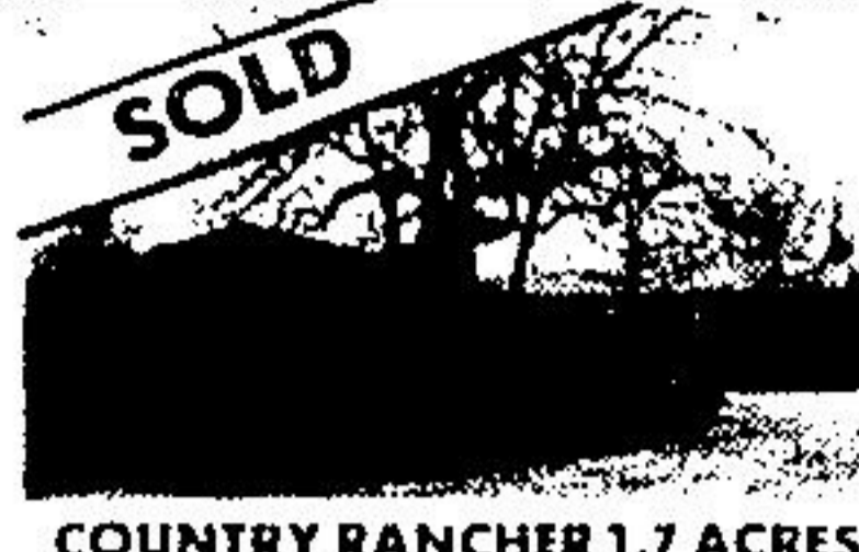
COUNTRY RANCHER 1.7 ACRES