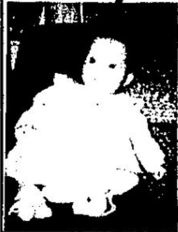
Gotcha! Love the in-laws