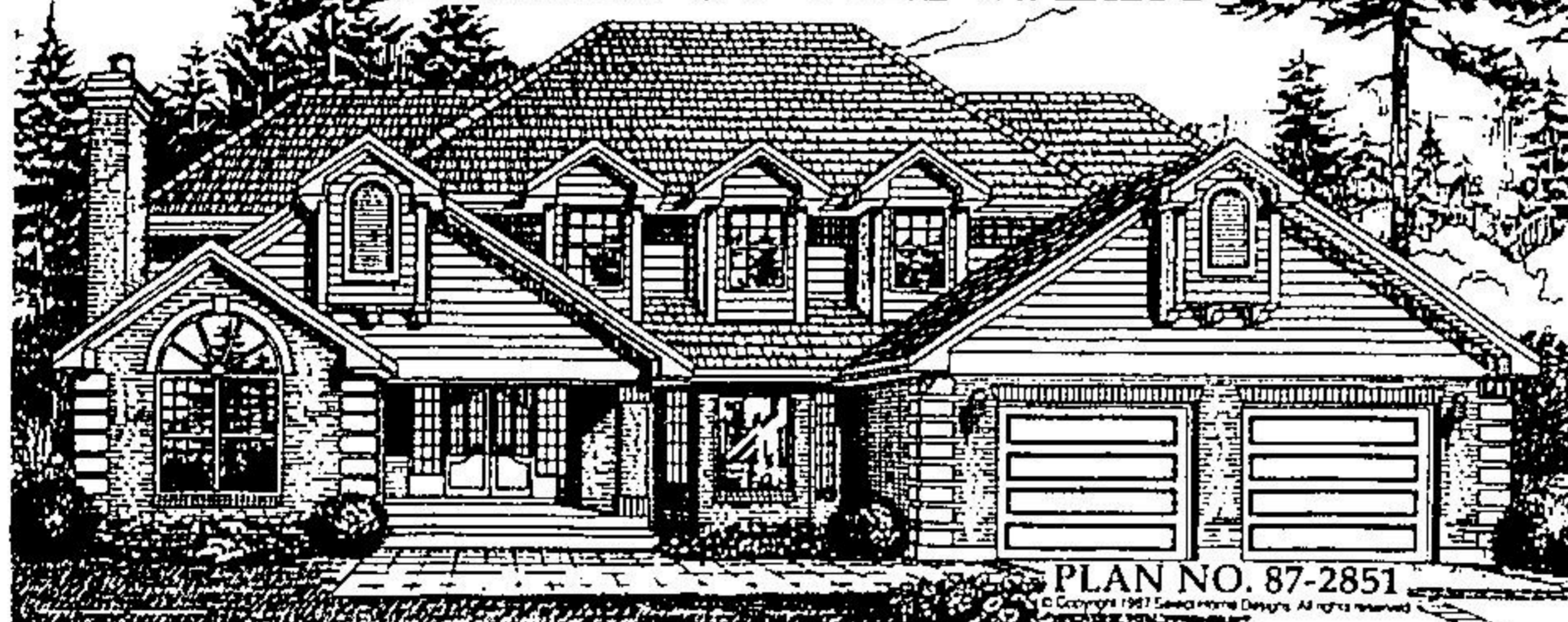
PLAN NO. 87-2851

EXCITING BLEND OF TRADITIONAL AND CONTEMPORARY